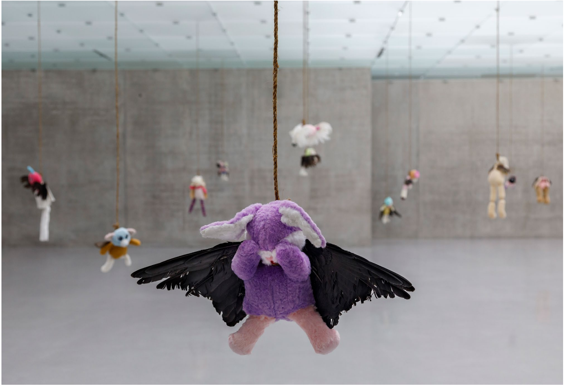
ONE EITHER LOVES ONESELF OR KNOWS ONESELF , Kunsthaus Bregenz, Bregenz, 2025