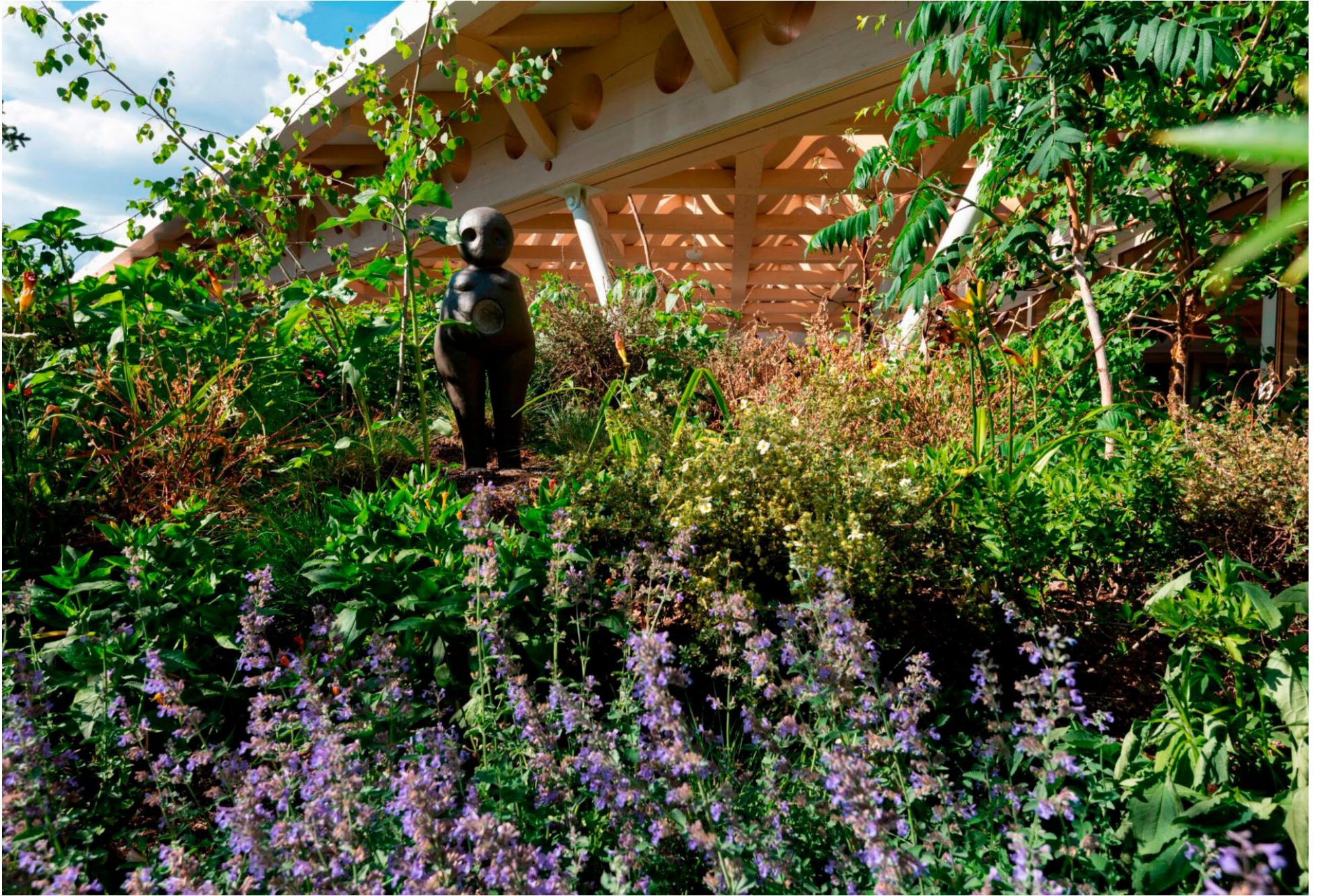
Every Earthly Morning the Sky's Light Touches Ur Life is Unprecedented in its Beauty , Aspen Art Museum, Aspen, 2021