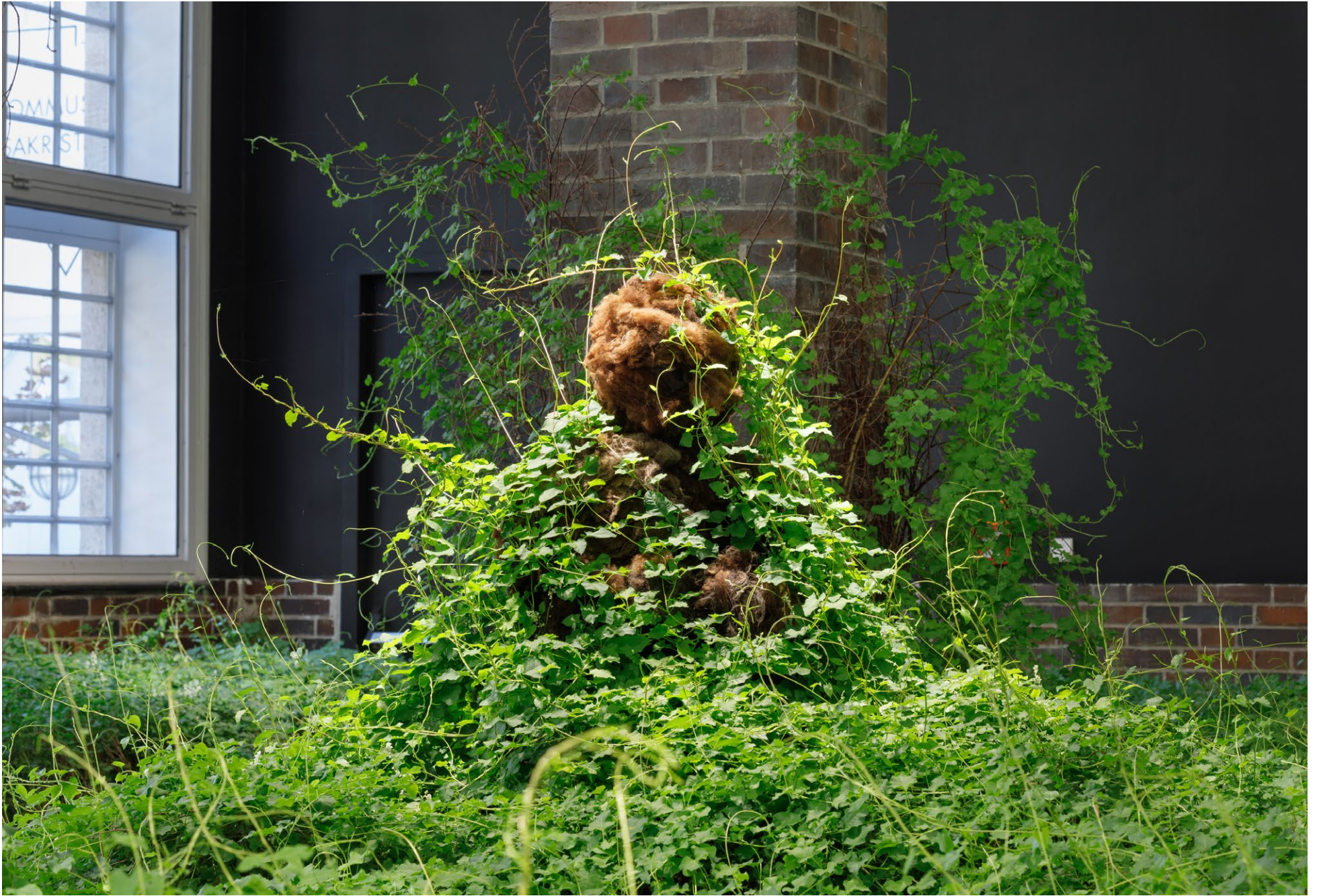
Earthseed , Museum Für Moderne Kunst, Frankfurt, 2020