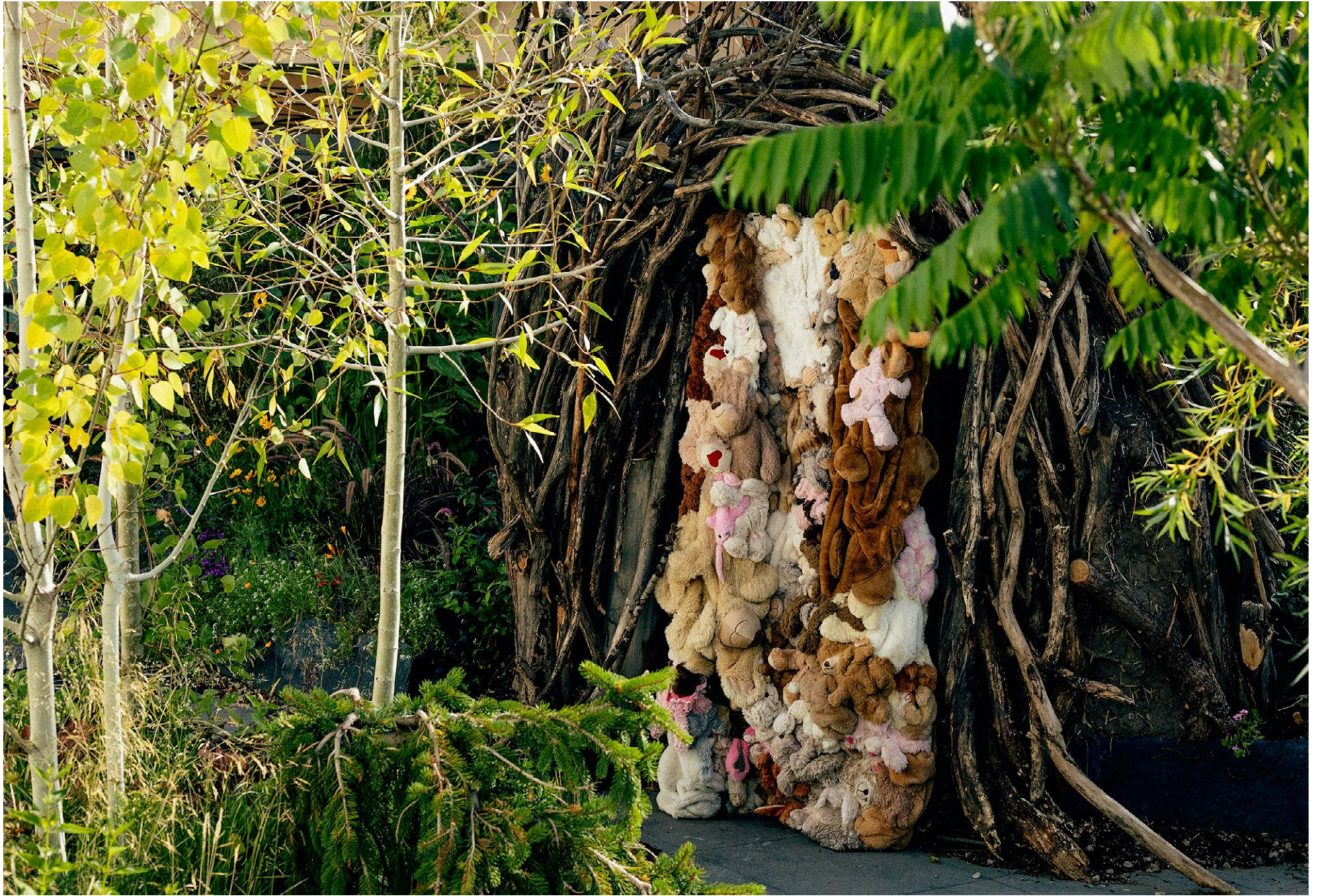
Every Earthly Morning the Sky's Light Touches Ur Life is Unprecedented in its Beauty , Aspen Art Museum, Aspen, 2021