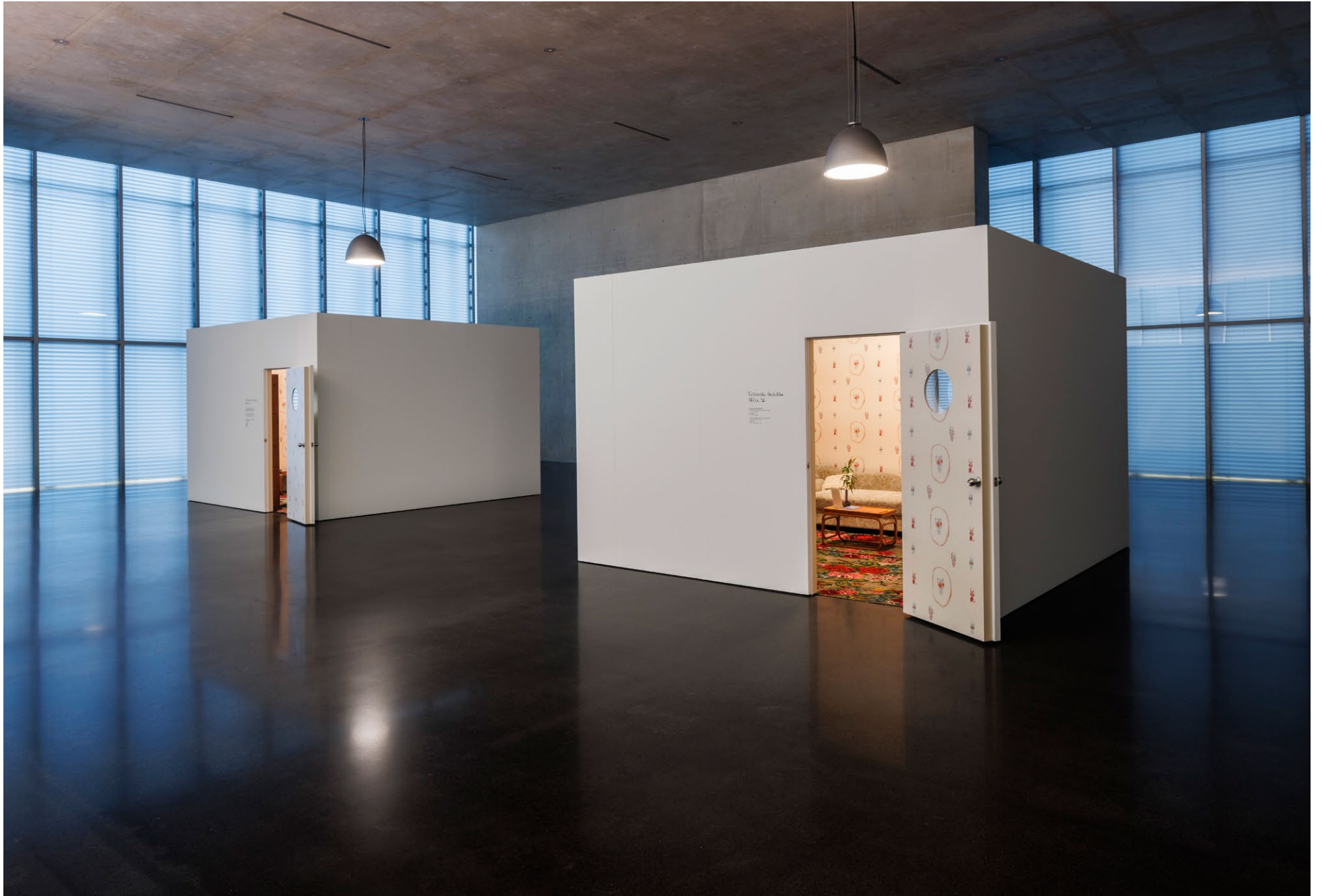
ONE EITHER LOVES ONESELF OR KNOWS ONESELF , Kunsthaus Bregenz, Bregenz, 2025