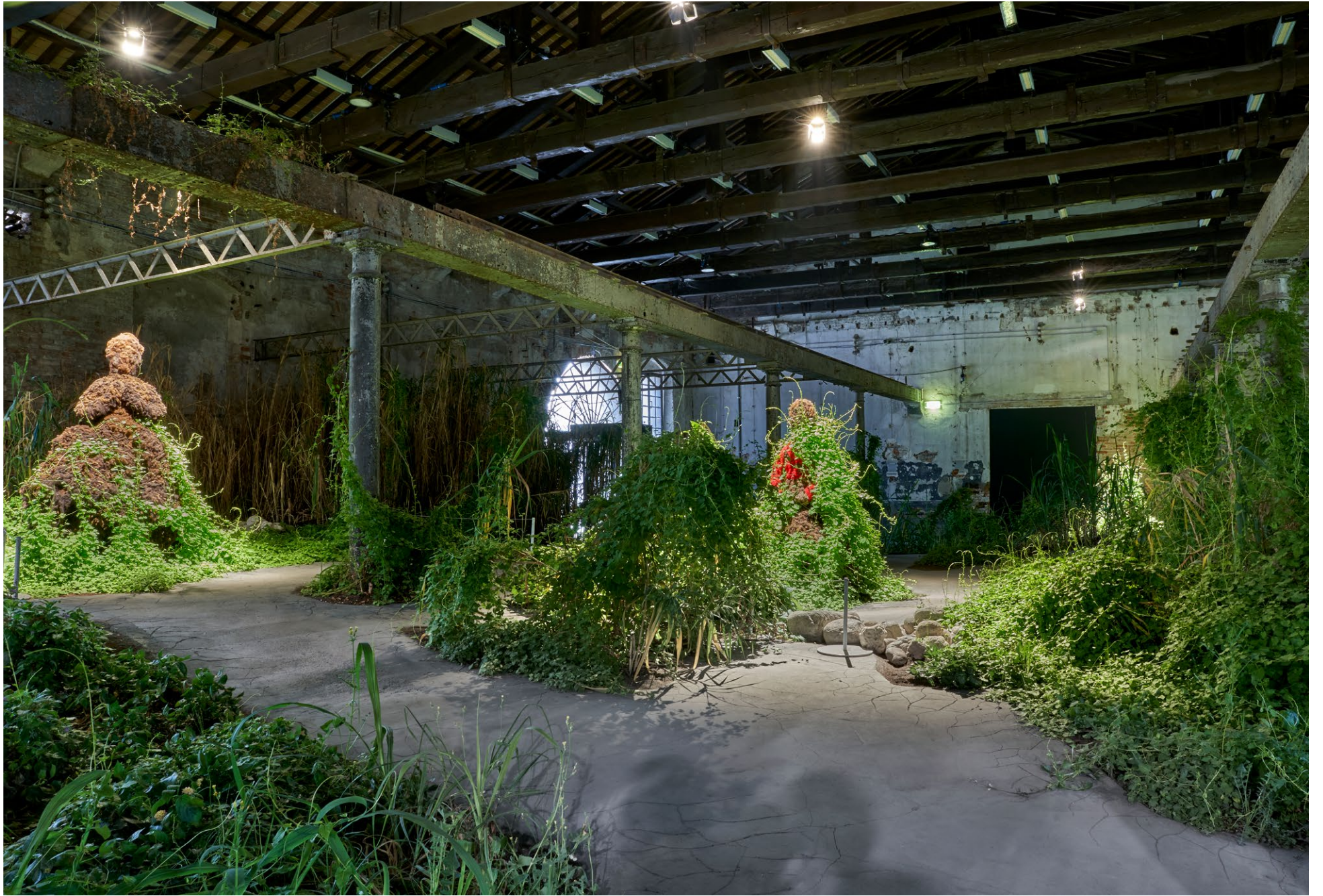
The Milk of Dreams , 59 th Venice Biennale, Venice, 2022