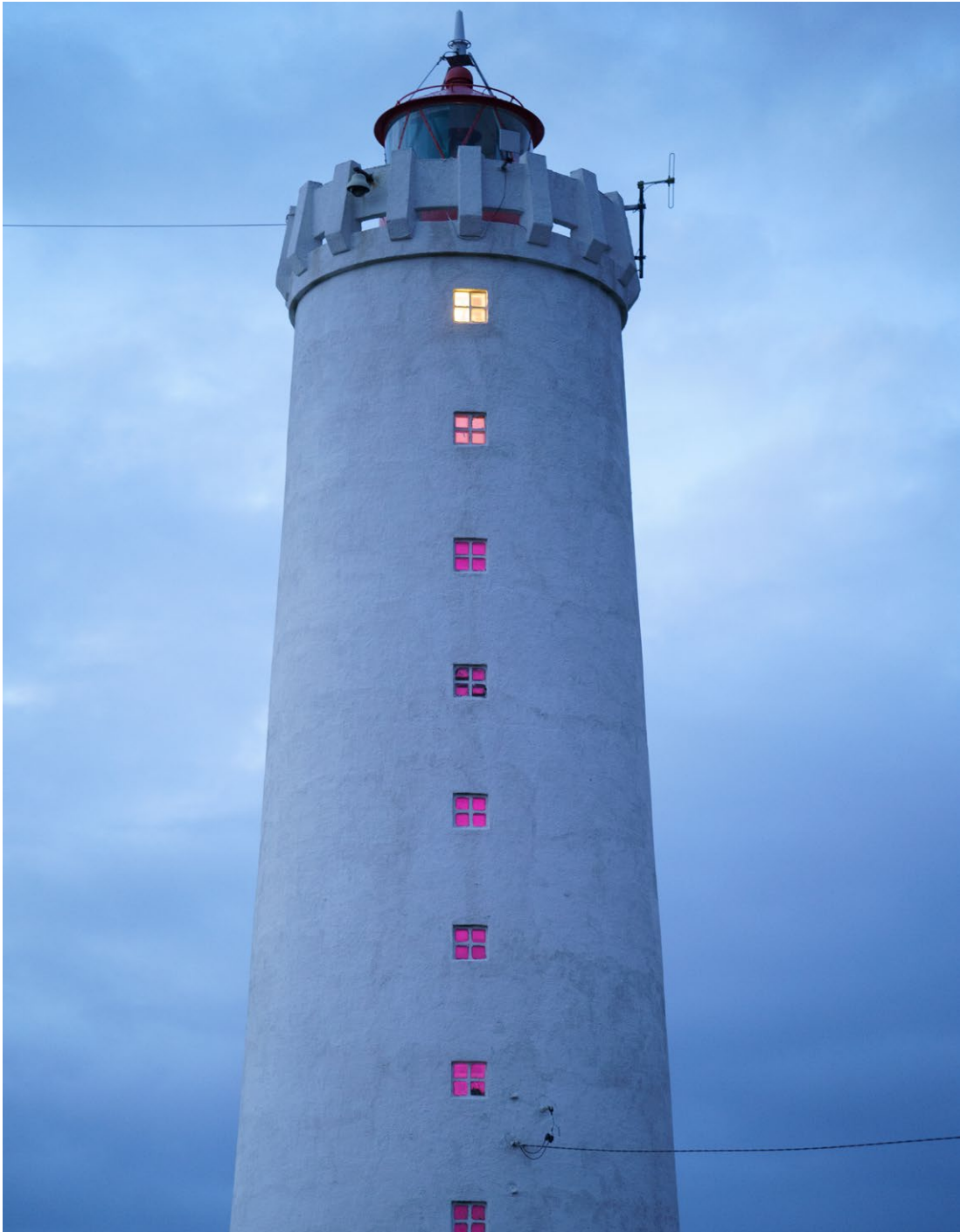
Can't See Sequences Biennial Reykjavik 2023