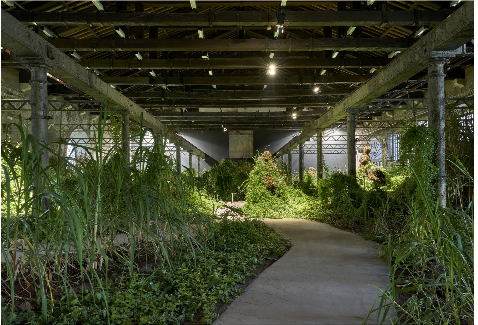
The Milk of Dreams , 59 th Venice Biennale, Venice, 2022