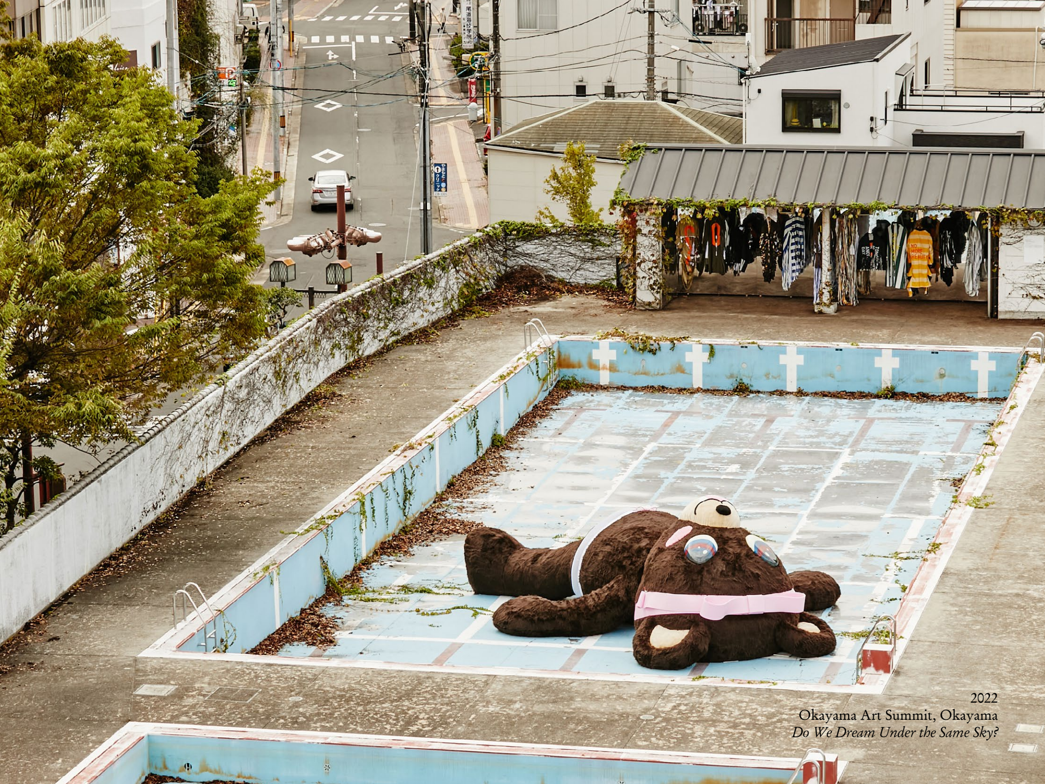
2022 Okayama Art Summit, Okayama Do We Dream Under the Same Sky?