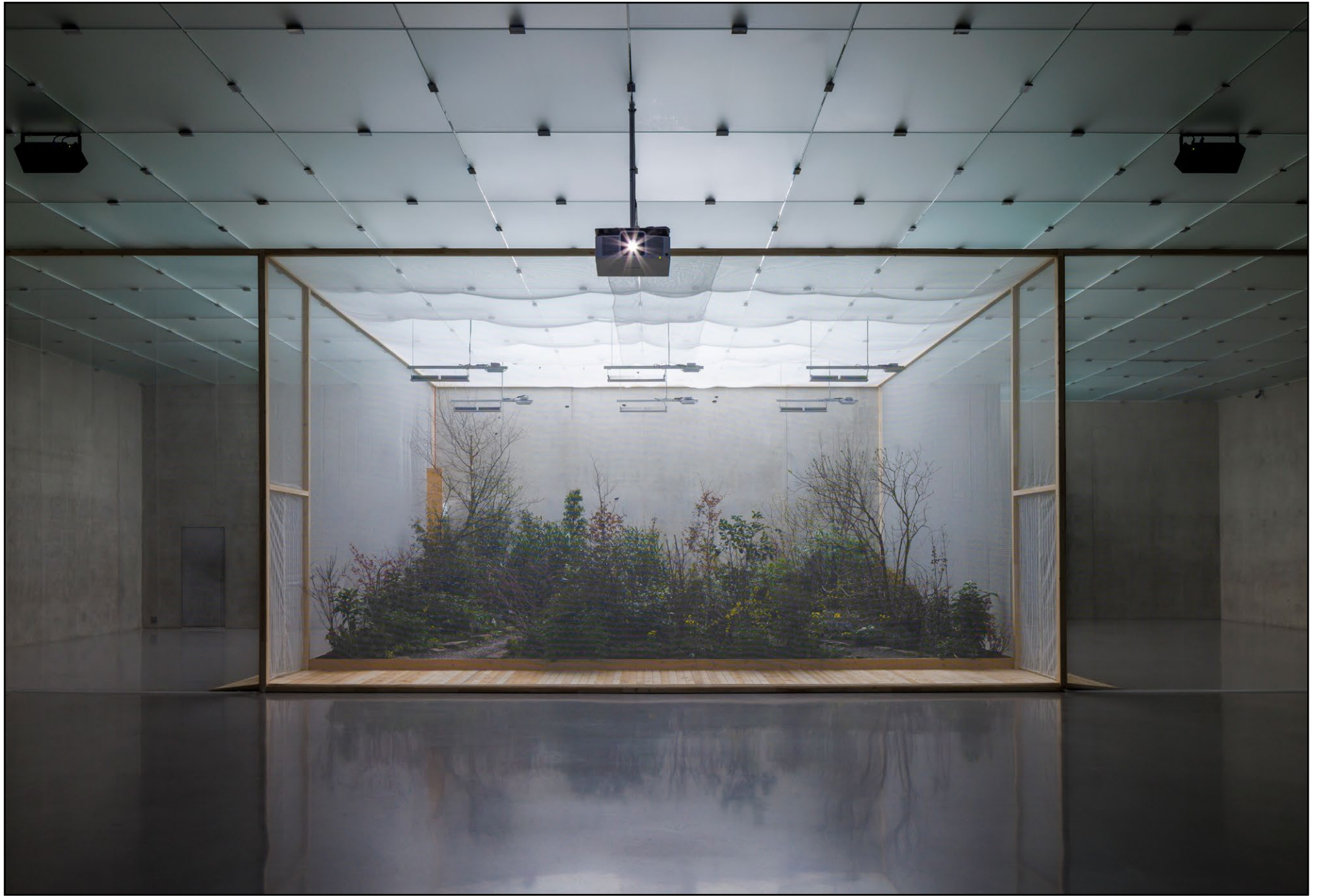
ONE EITHER LOVES ONESELF OR KNOWS ONESELF , Kunsthaus Bregenz, Bregenz, 2025