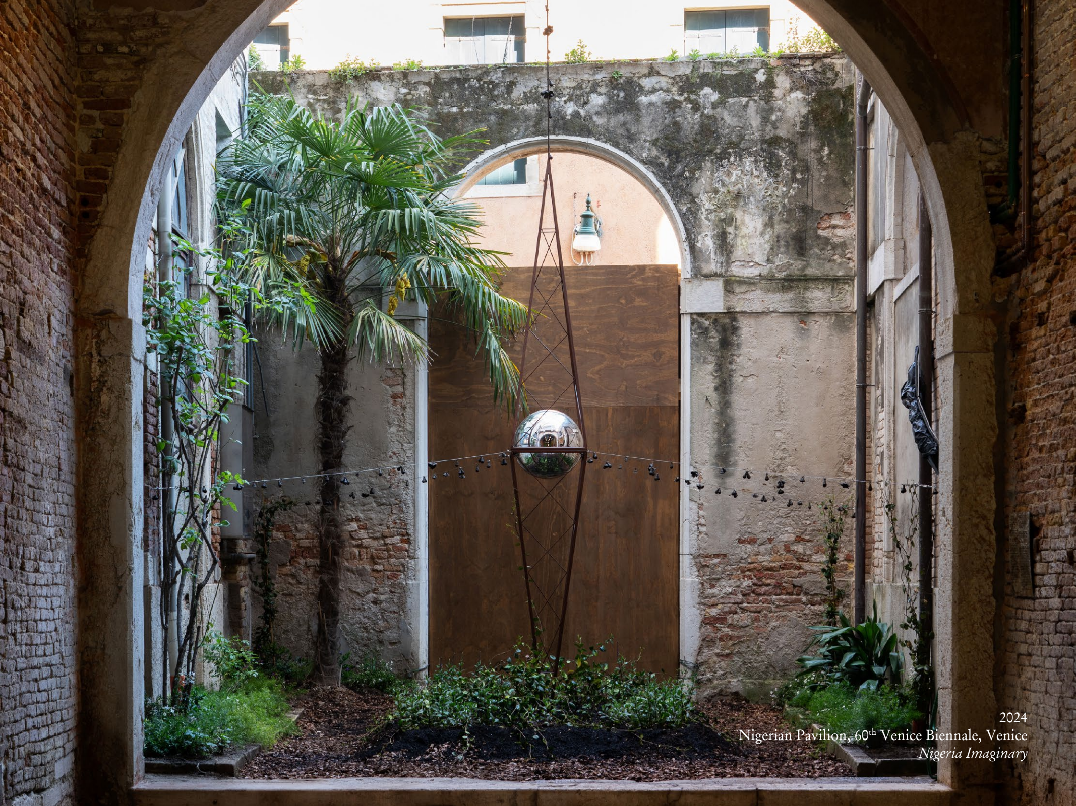
2024 Nigerian Pavilion, 60 th Venice Biennale, Venice Nigeria Imaginary