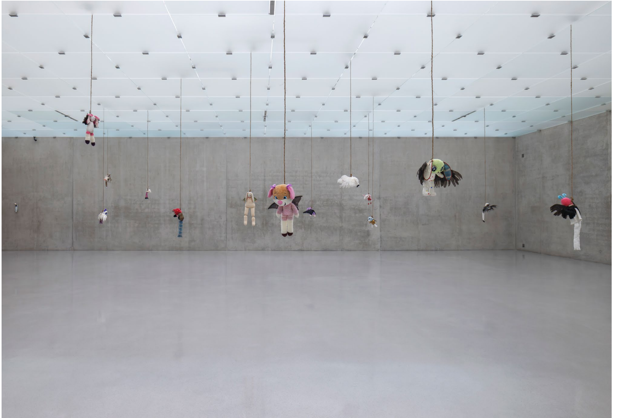
ONE EITHER LOVES ONESELF OR KNOWS ONESELF , Kunsthaus Bregenz, Bregenz, 2025