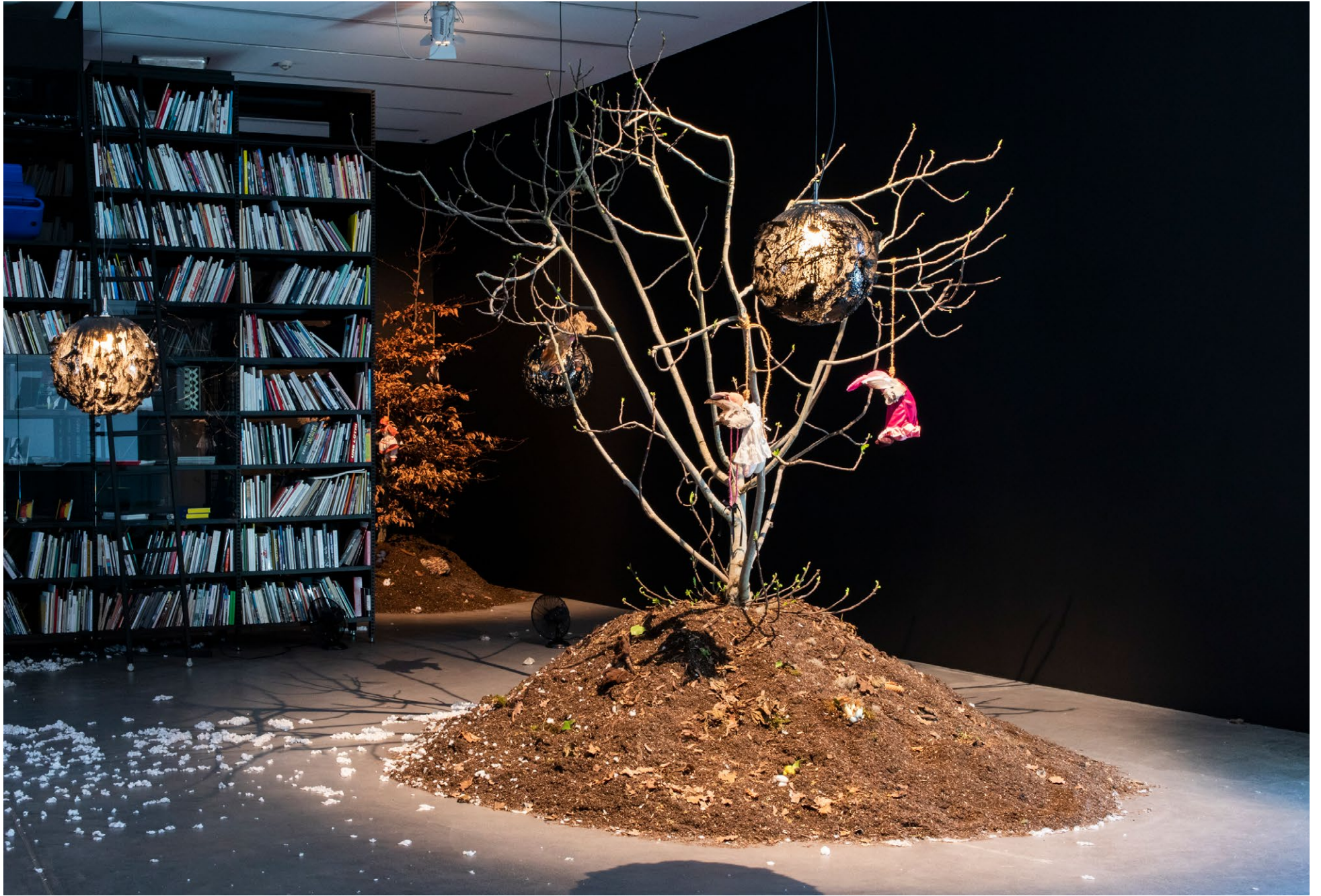
A Drop of Sun Under The Earth , LUMA Westbau, Zurich, 2019