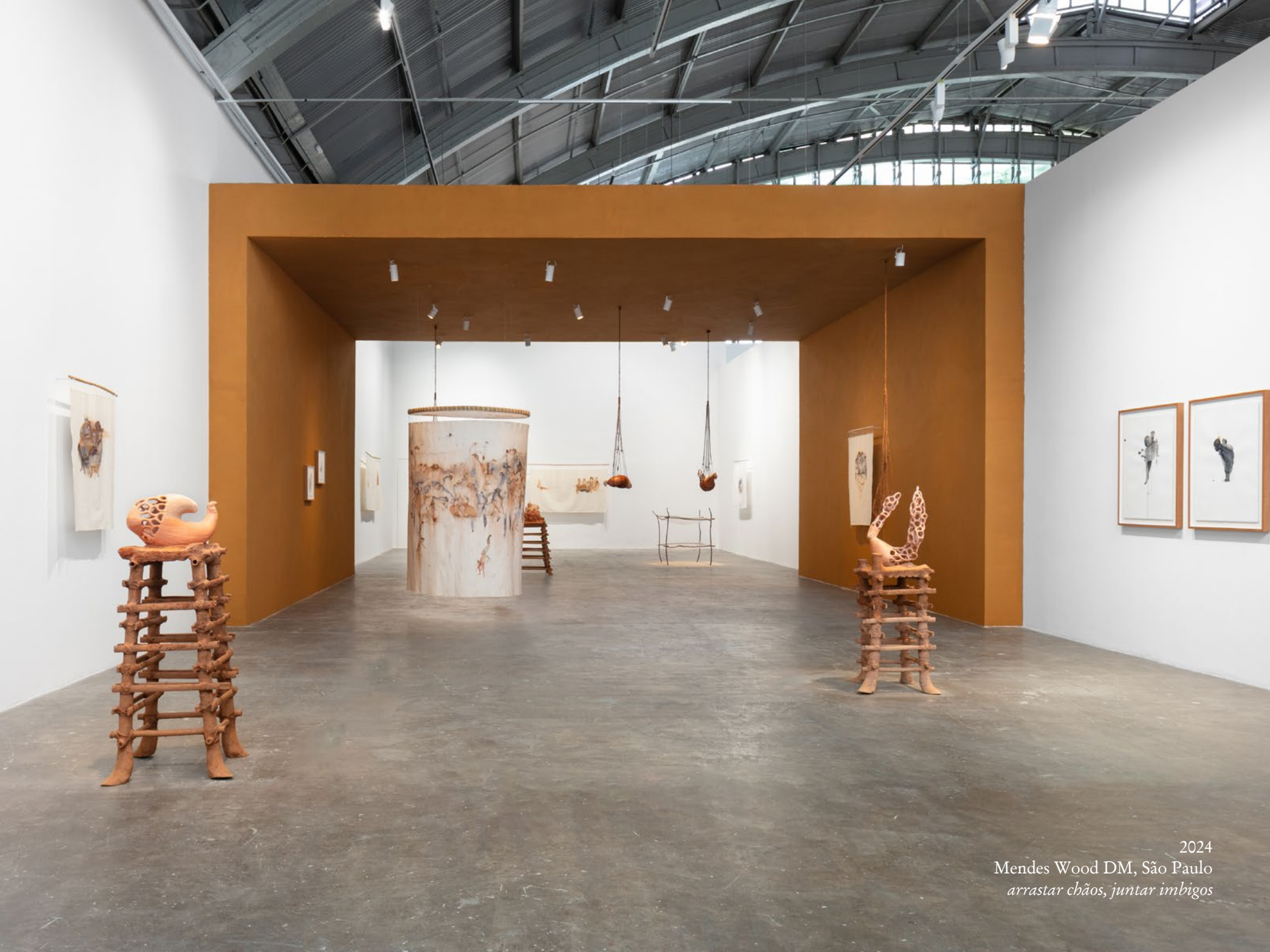
2024 Mendes Wood DM, São Paulo arrastar chãos, juntar imbigos