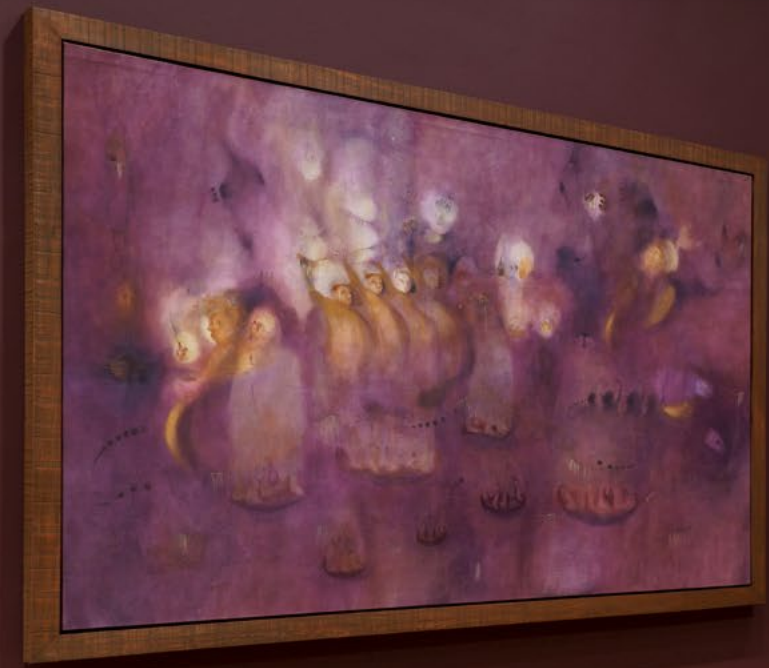
2026 Mendes Wood DM, Brussels A Serene Look upon the World

A Serene Look upon the World addresses these tensions through artistic gestures that comfort and unsettle in equal measure. A human impulse drives us to organize thought through principles that offer some stability to our understanding of everyday life. We also tend to break down and rationalize the processes that guide artistic creation, as if to demystify them. Yet even armed with a theoretical and historical repertoire, the viewer is not immune to unease when faced with works that evoke mystery.