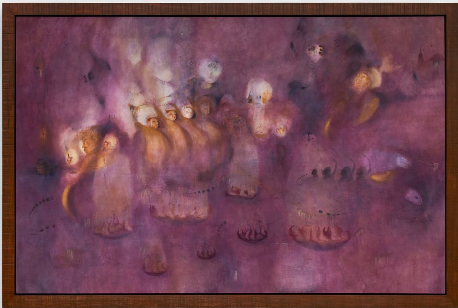
Josi, taturana que ajambra fiapo corre , da série: breu imaginoso , 2026, water from the Jequitinhonha River, jabuticaba, black beans, indigo and campeche vegetal paints, anthill soil from the Quilombo dos Ausentes, green soil from Seu Maurício, 135 x 211 x 3 cm | 53 1/8 x 83 1/8 x 1 1/8 in, MW.JSL.118