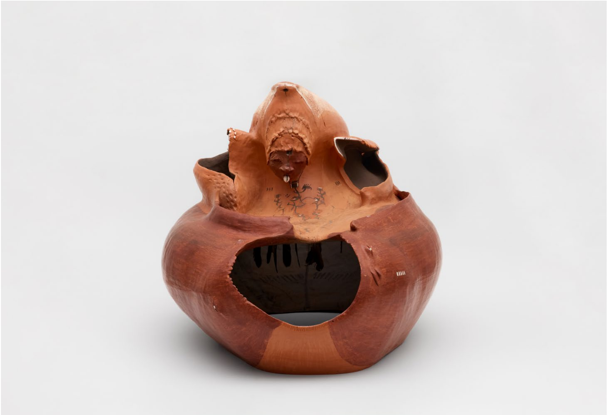
Josi, Fulômaê , 2025, ceramic, soil, feathers, charcoal, oleio (from Ducarmo), and black stone (from Lily Shipibo), 60 x 44 x 42 cm | 23 5/8 x 17 3/8 x 16 1/2 in, MW.JSI.113