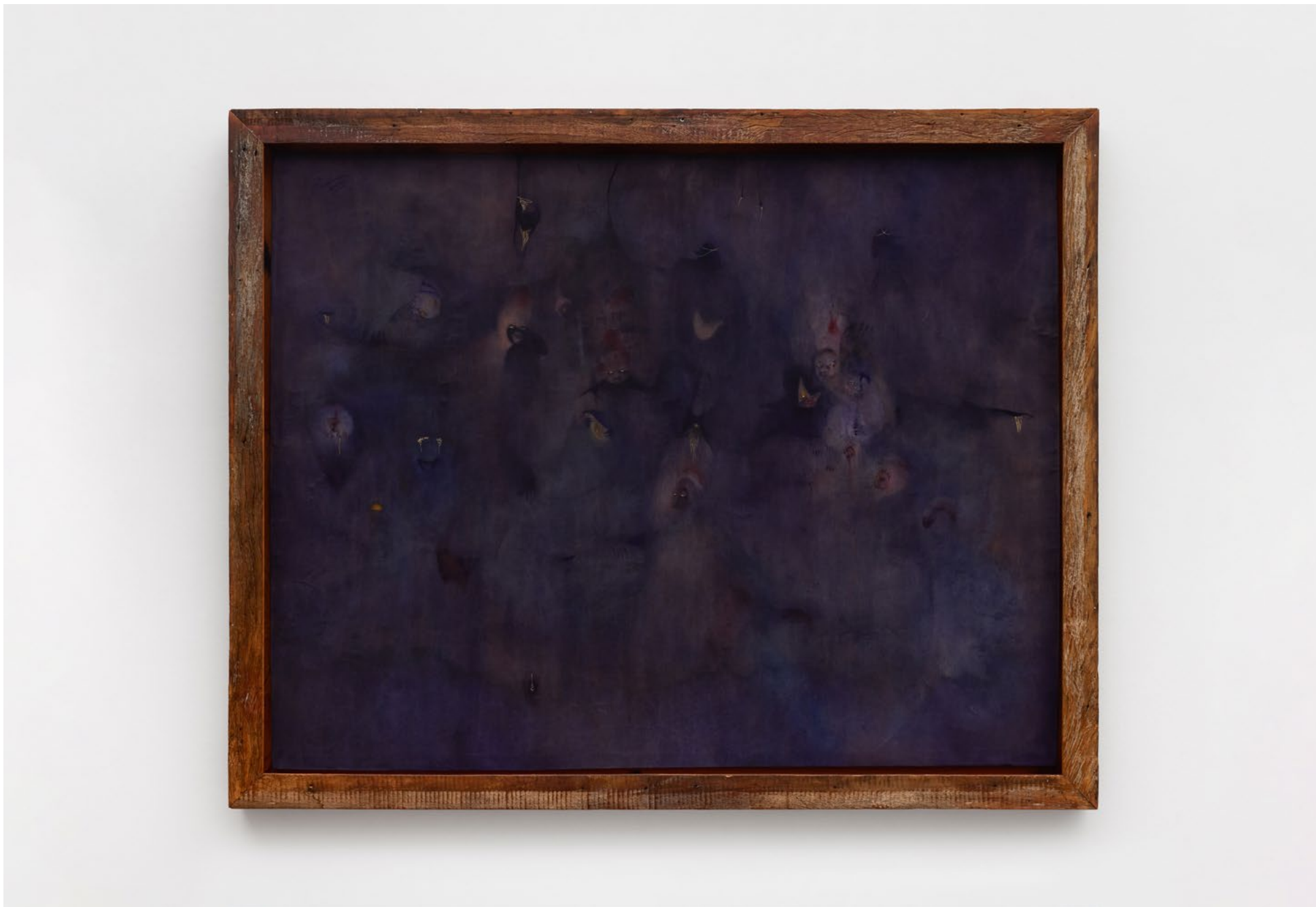
Josi , depois das 6 não se usa pente fino , da série: breu imaginoso , 2025, water from the Jequitinhonha River, black beans, brazilwood, silver embaúba (Cecropia), anthill soil from the Quilombo dos Ausentes – MG, and plant-based violet campeche dye on fabric and a reclaimed wood crate, 110.5 x 140.5 x 3 cm | 43 1/2 x 55 1/4 x 1 1/8 in, MW.JSI.115