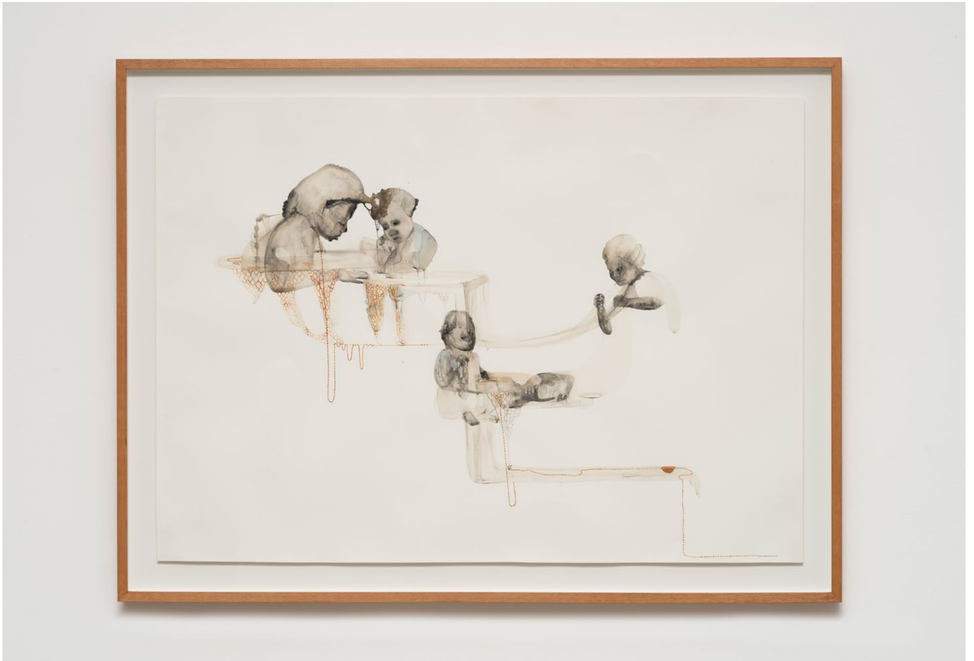
Josi, from the series: decantações, fervuras e temperamentos , 2022, black beans water, banana stain and soil on paper, 73 x 101 cm | 28 3/4 x 39 3/4 in, MW.JSI.059