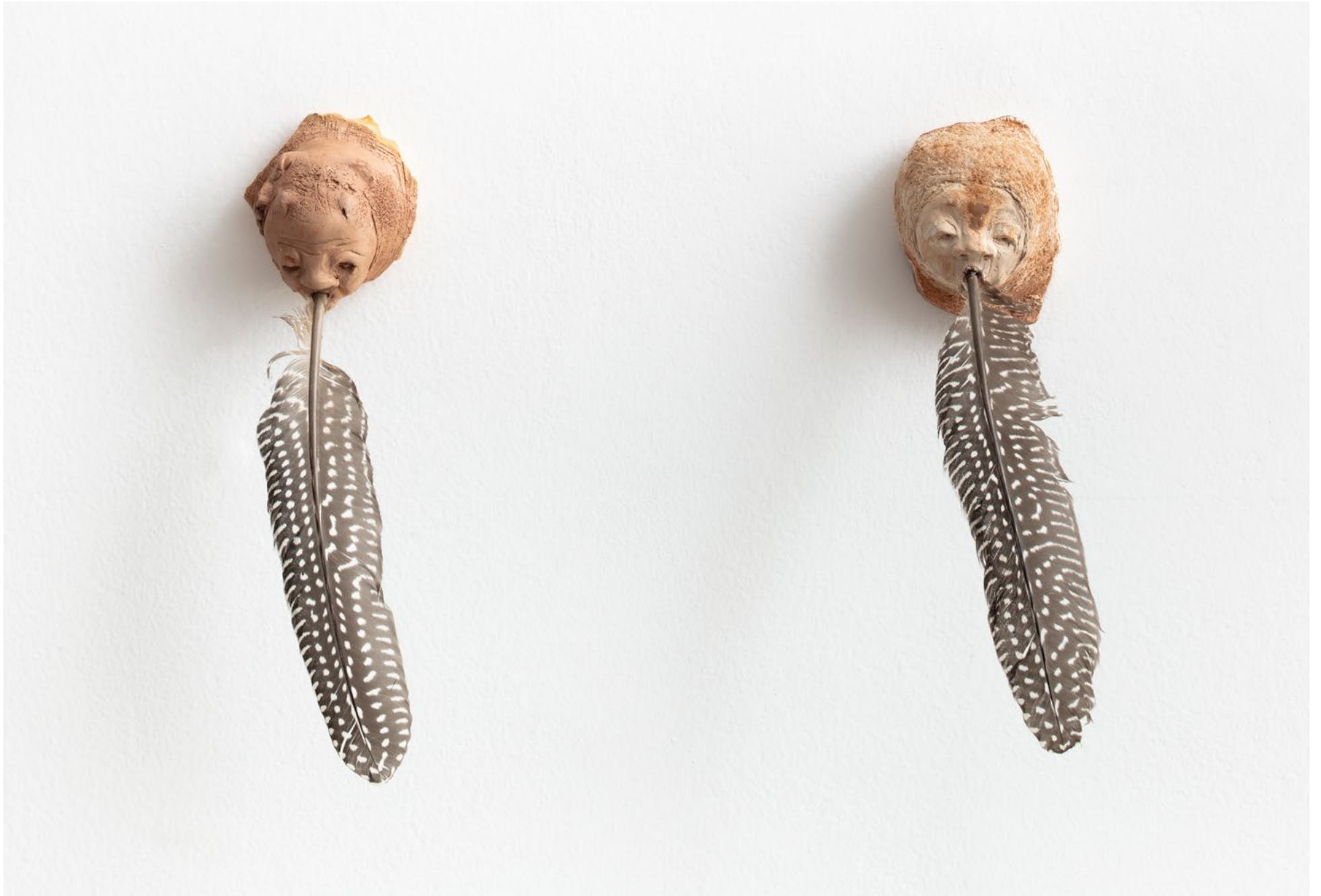
Josi, indacas , 2024, ceramic and guineafowl feathers, 6 x 7 x 24 cm | 2 3/8 x 2 3/4 x 9 1/2 in (each), MW.JSI.093