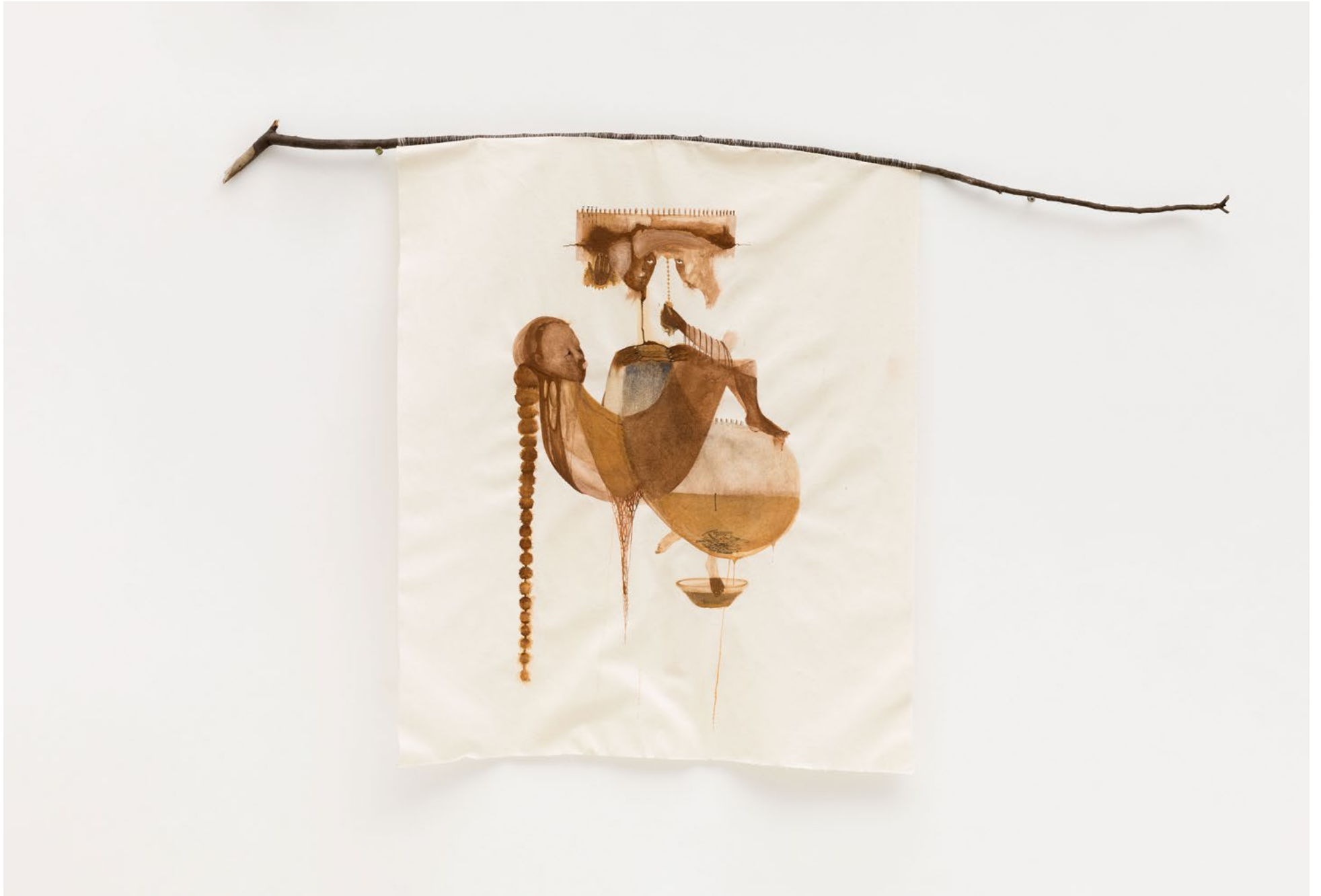
Josi, Untitled , from the Series: With land and some who are born from it , 2022, black bean water and soil on cotton, sewn onto branch, 93 x 79 cm | 36 5/8 x 31 1/8 in, MW.JSI.027