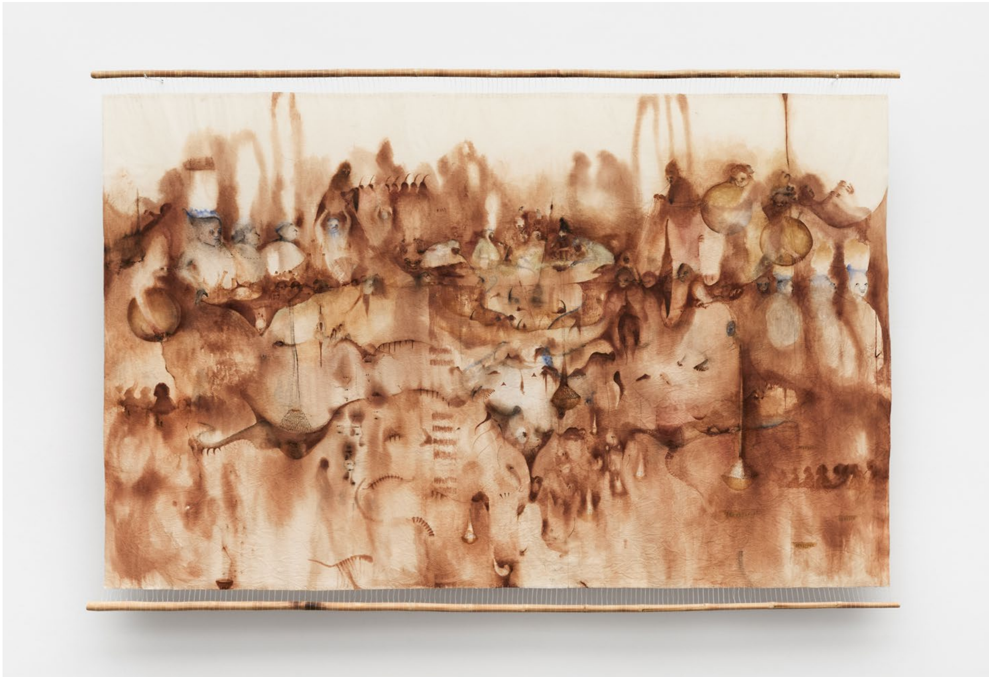
Josi, Istrudia , 2025, aroeira, indigo, ink-grass, charcoal, and soils from Seu Mauricio on fabric sewn onto bamboo, 118 x 185 cm | 46 1/2 x 72 7/8 in, MW.JSI.110