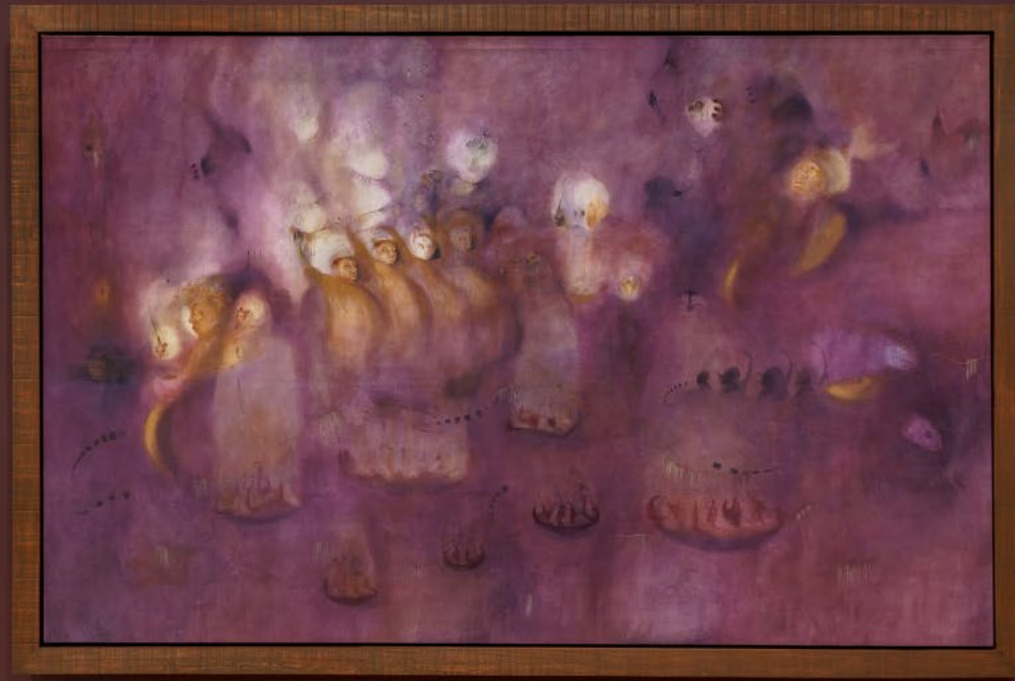
2026 Mendes Wood DM, Brussels A Serene Look upon the World