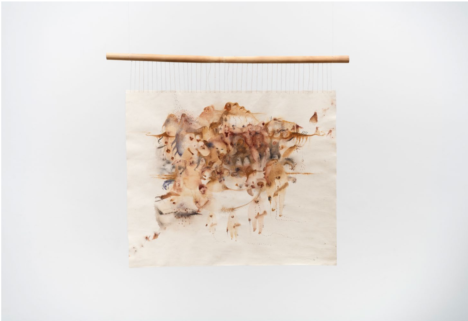
Josi, Luz de picão , 2024, chãos coletados, água de feijão preto, urucum, eucalipto, picão, carvão e outros mistérios sobre tecido engomado, 61 x 53 cm | 24 x 20 7/8 in, MW.JSI.081