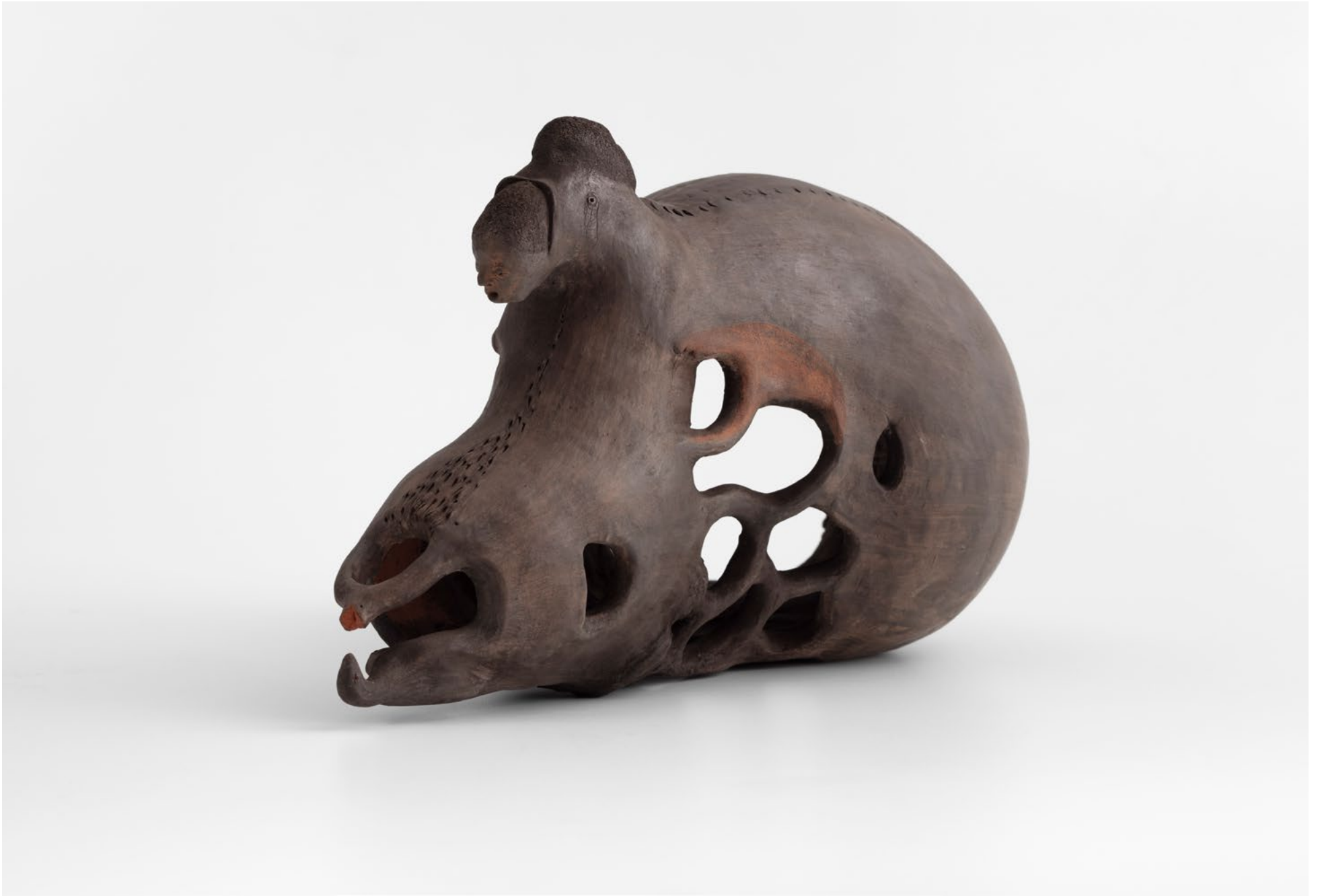
Josi, Igbiri , 2024, ceramic, 38.5 x 20.5 x 24.5 cm | 15 1/8 x 8 1/8 x 9 5/8 in, MW.JSI.092