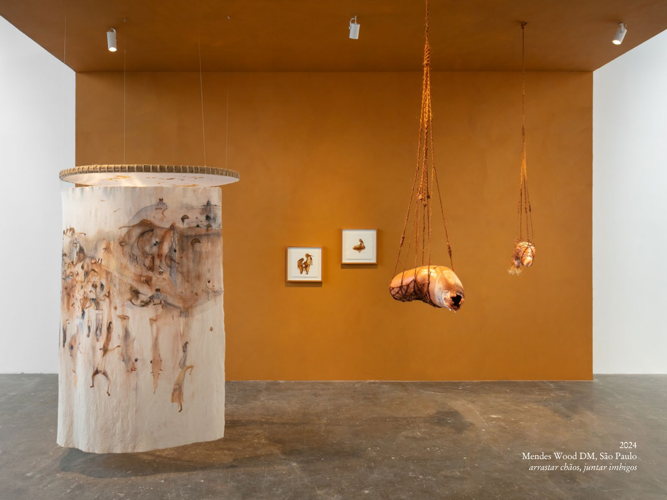
2024 Mendes Wood DM, São Paulo arrastar chãos, juntar imbigos