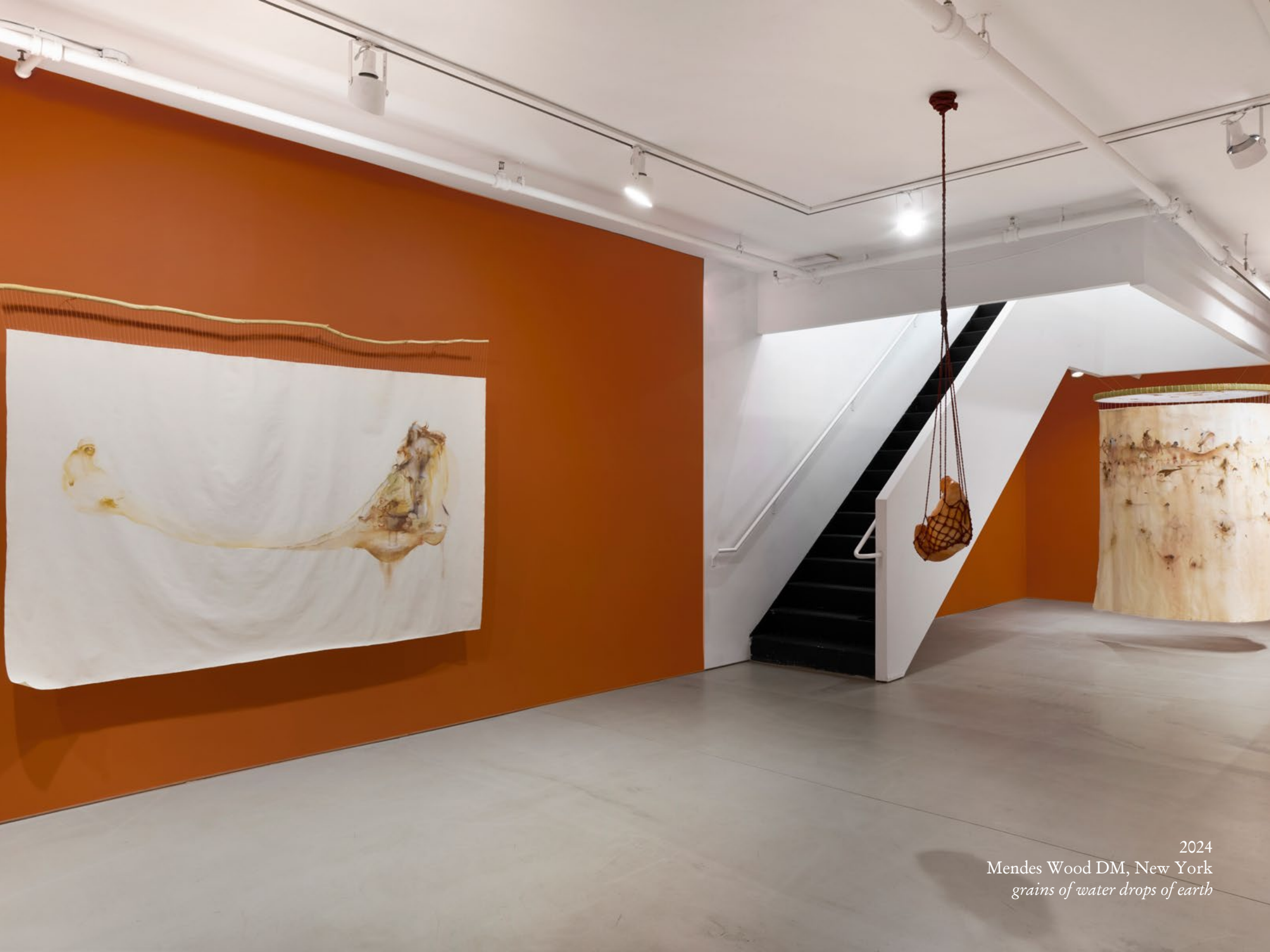
2024 Mendes Wood DM, New York grains of water drops of earth