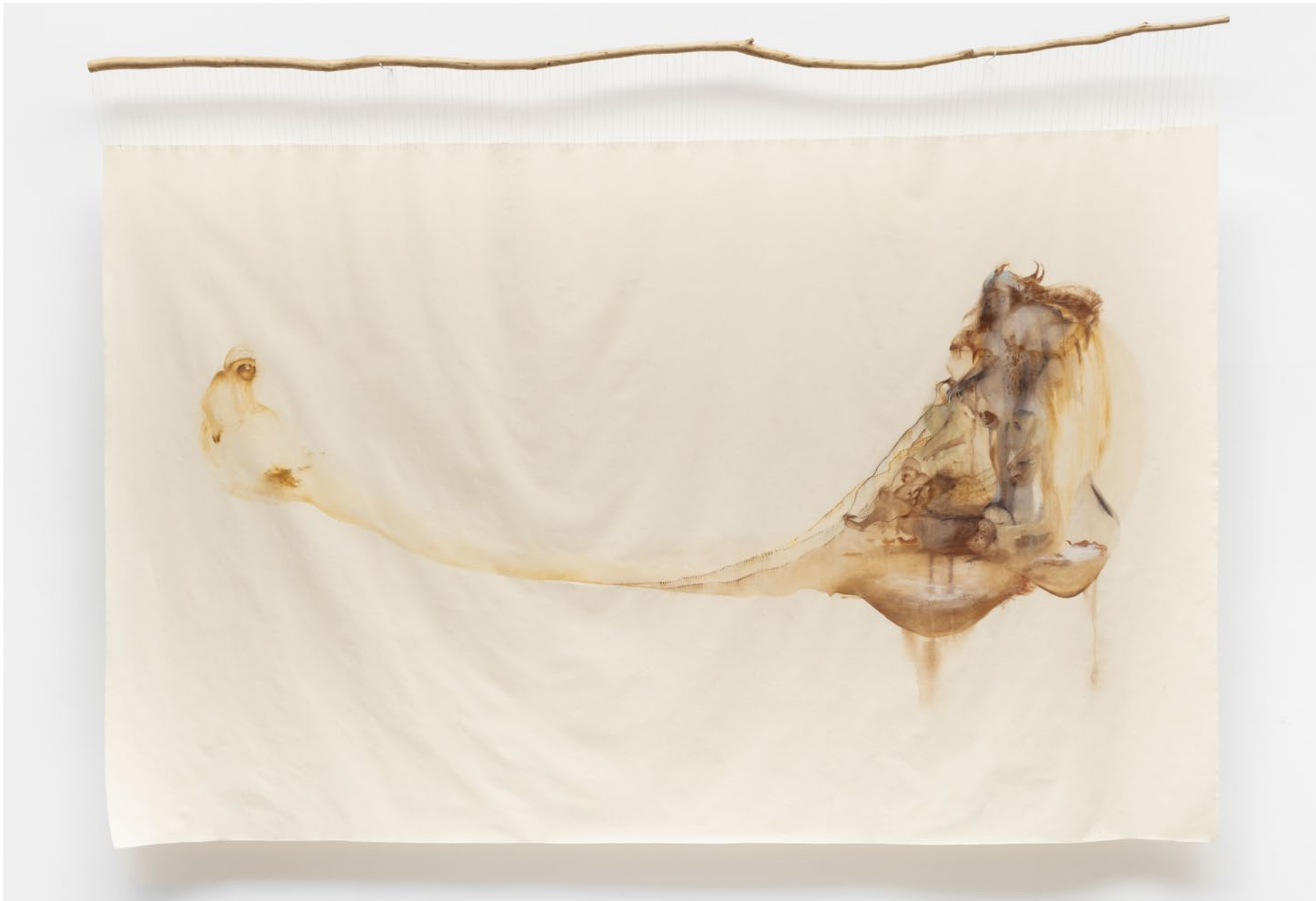
Josi, da série grão de água, gota de terra, 2024, black bean, coal, annatto, soil from Morro Vermelho-MG, Entre Rios de Minas-MG e Vale do Jequitinhonha-MG, 165 x 230 cm | 65 x 90 1/2 in, MW.JSI.082