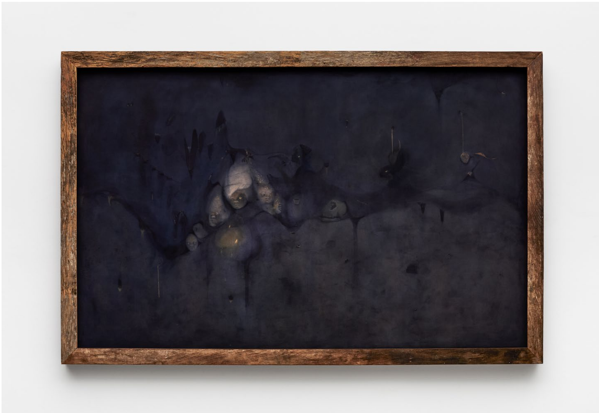
Josi, Não se espana teia de aranha , da série: breu imaginoso , 2025, black bean, banana node, aroeira, anthill soils from Quilombo dos Ausentes (MG), toá, and waters from the Olho d'Água stream (MG) on stretched cotton fabric and a reclaimed wooden box, 119.5 x 184 cm | 47 x 72 1/2 in, MW.JSI.097