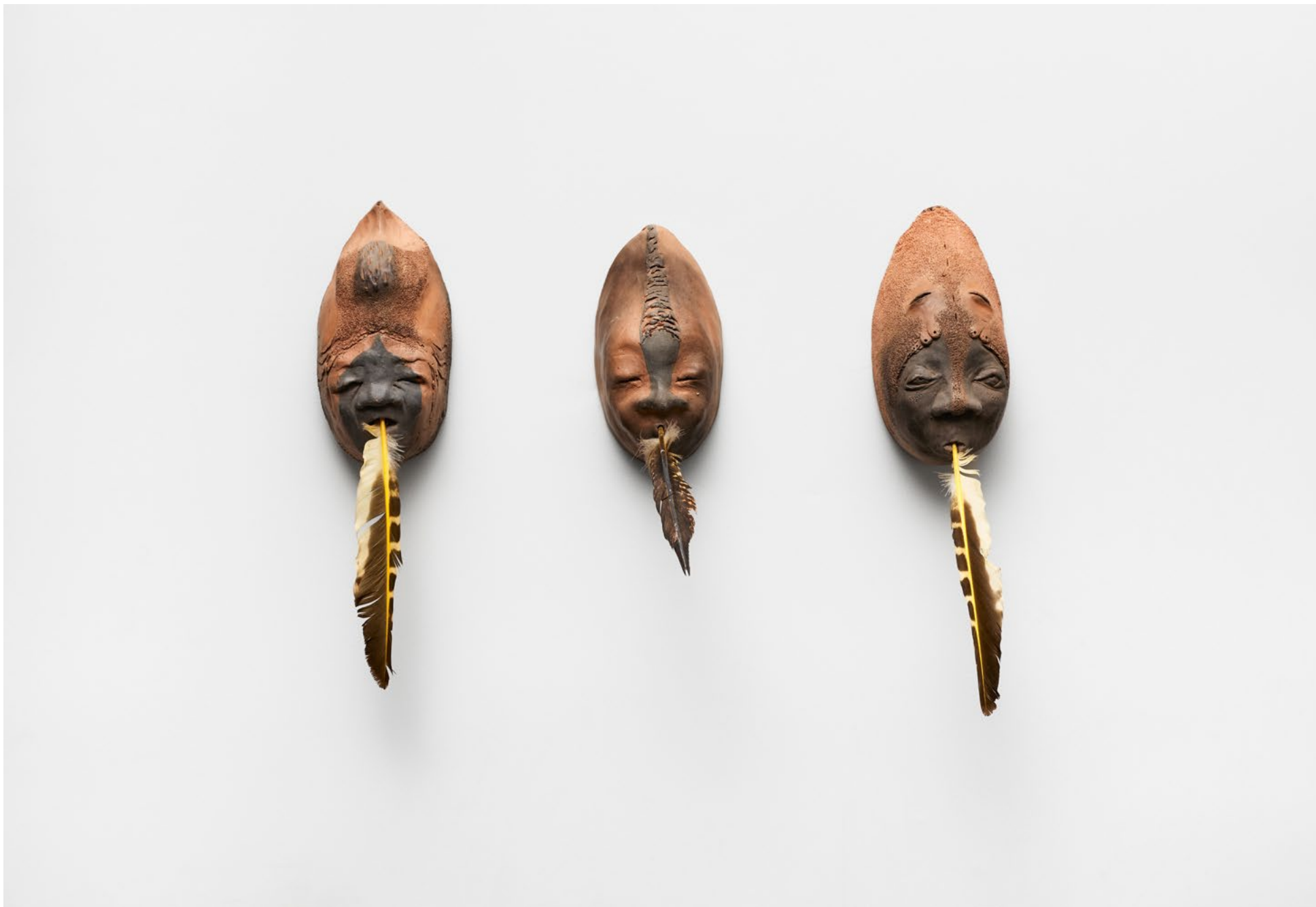
Josi, Da série: o vôo das indacas , 2025, burnt ceramic in the Navel of Nyame, then singed in the fire, and a woodpecker feather collected in Moeda (MG), 23 x 6 x 5.5 cm, 16 x 6 x 14 cm, 23 x 6.4 x 10