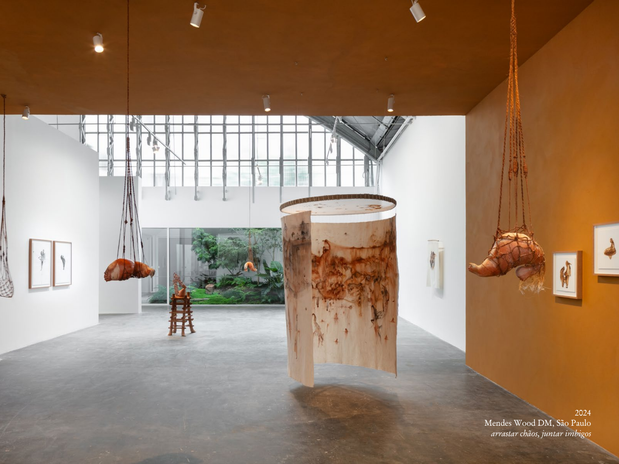
2024 Mendes Wood DM, São Paulo arrastar chão, juntar imbigos