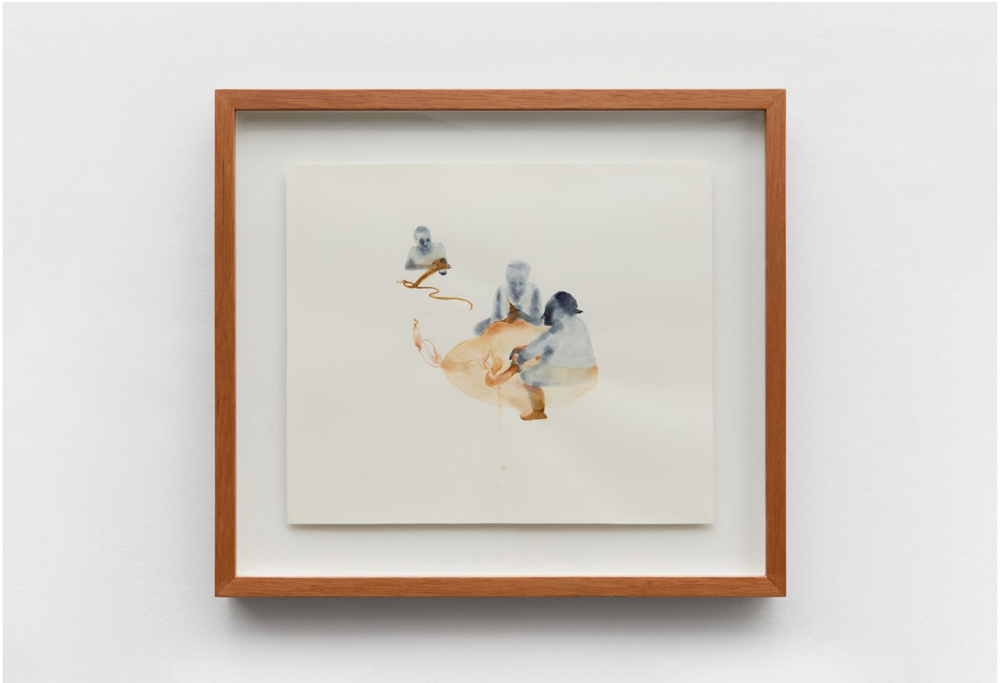
Josi, Da série: decantações, fervuras e temperamentos , 2025, black bean water, ink-grass, and toá red from Xakriabá Territory (MG) on paper, 28.8 x 33.8 cm | 11 3/8 x 13 1/4 in, MW.JSI.108