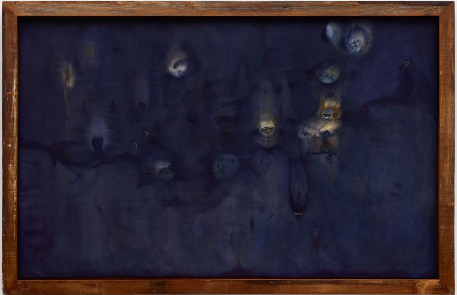
Josi, não se assenta em pedra de amolar , da série: breu imaginoso , 2025, water from the Jequitinhonha River, black beans, silver embaúba (Cecropia), anthill soil from the Quilombo dos Ausentes – MG, and plant-based violet campeche dye on fabric and a reclaimed wood crate, 106 x 172 x 3 cm | 41 3/4 x 67 3/4 x 1 1/8 in, MW.JSI.116