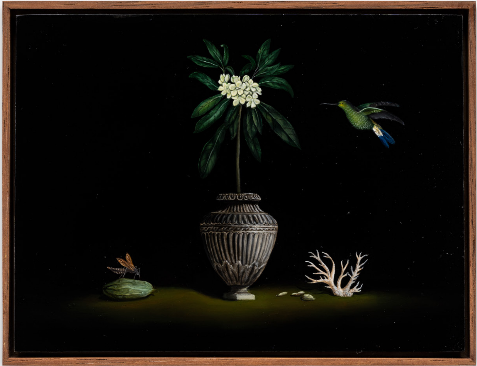
Nothing will please me more , 2022, oil on panel, 16 x 21 cm