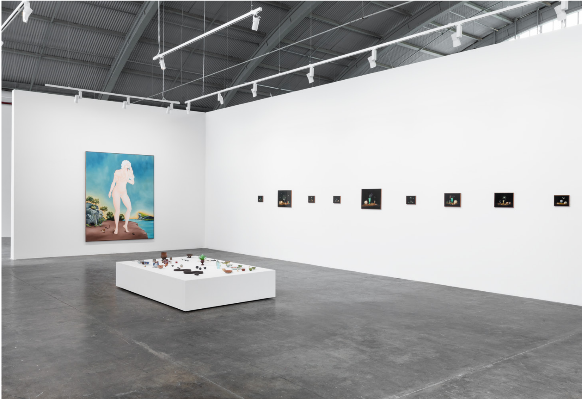
In my dreams, I kill him every night , Mendes Wood DM, São Paulo, 2022