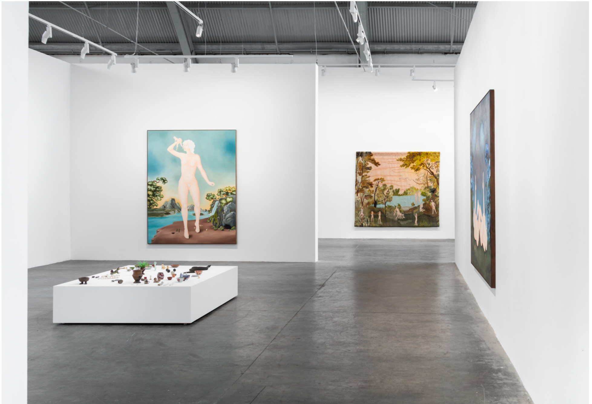
In my dreams, I kill him every night , Mendes Wood DM, São Paulo, 2022