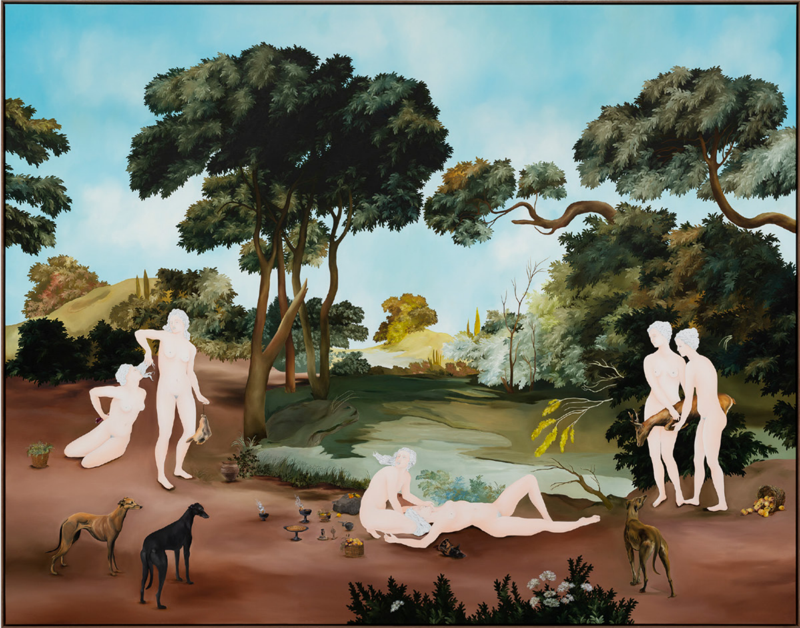
Under the influence of poison , 2018, oil and pencil on canvas, 180 x 230 cm