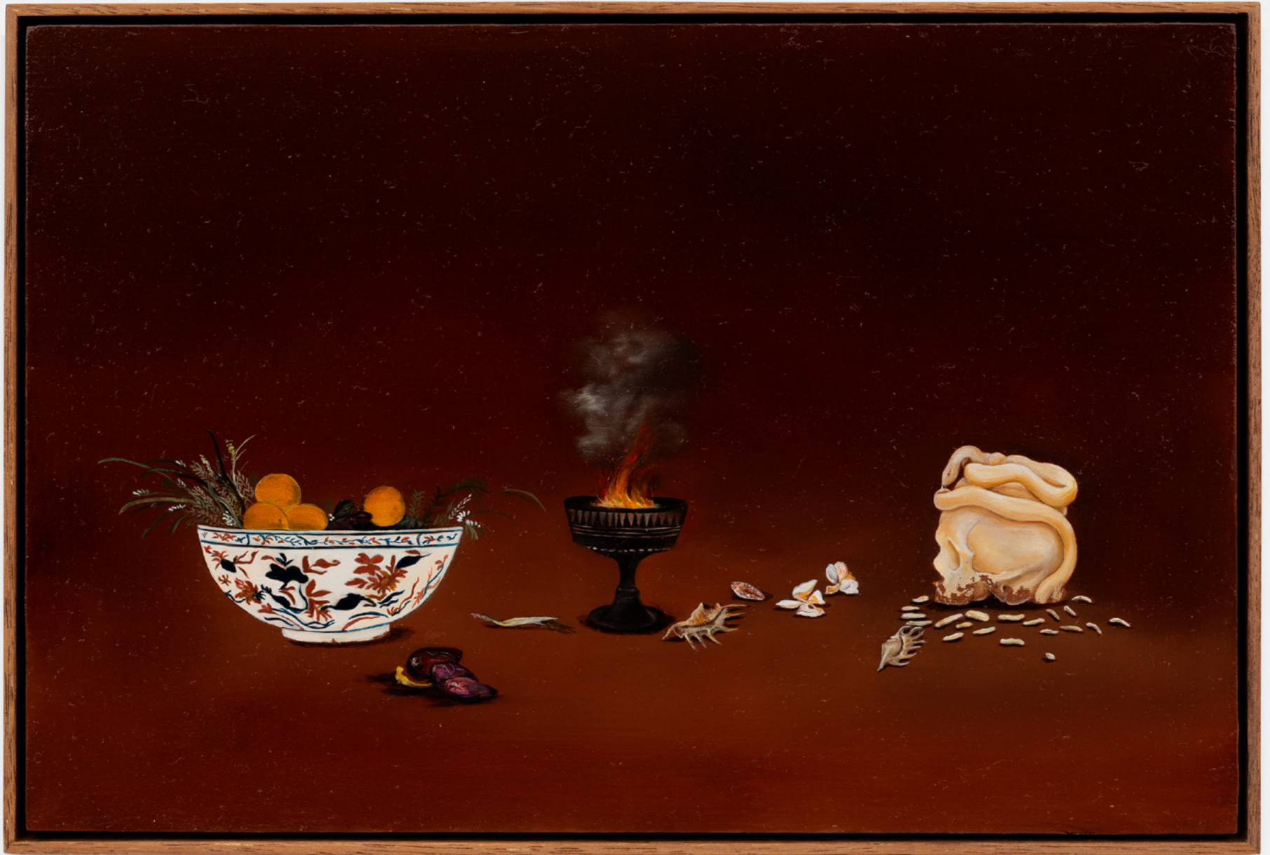
Sweet, murderous desire , 2019, oil on panel, 21 x 31 cm