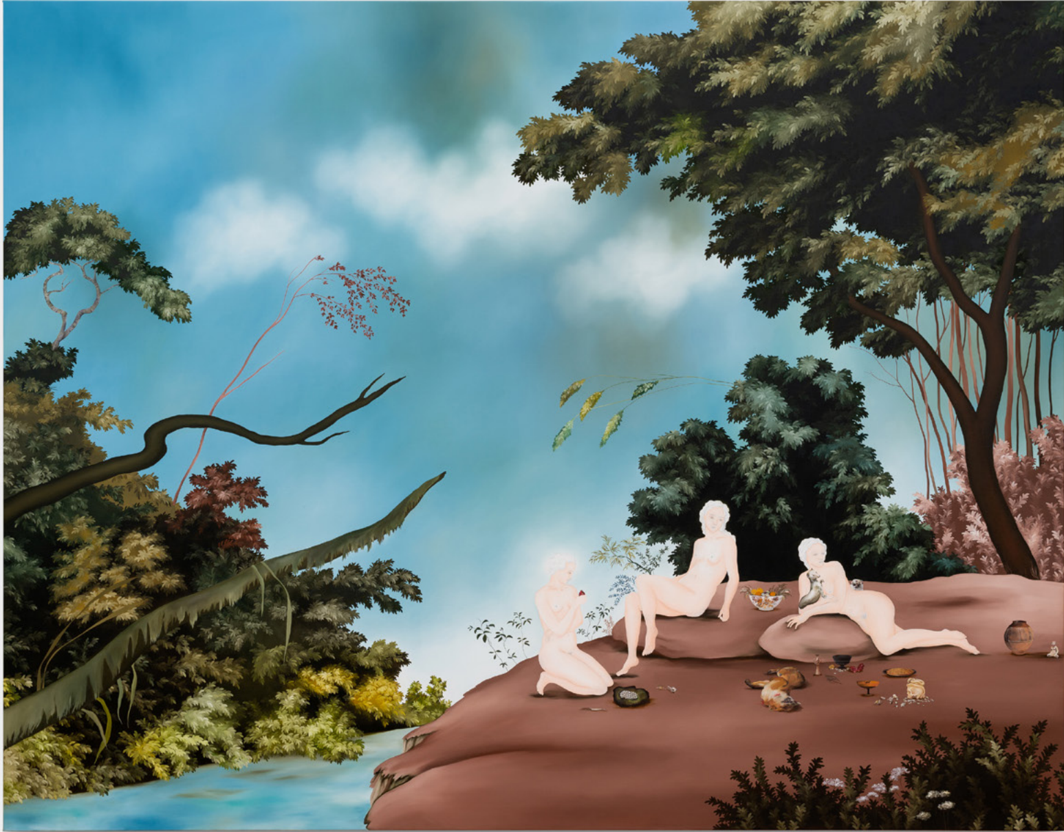
There are kisses for us all , 2019, oil and pencil on canvas, 180 x 230 cm