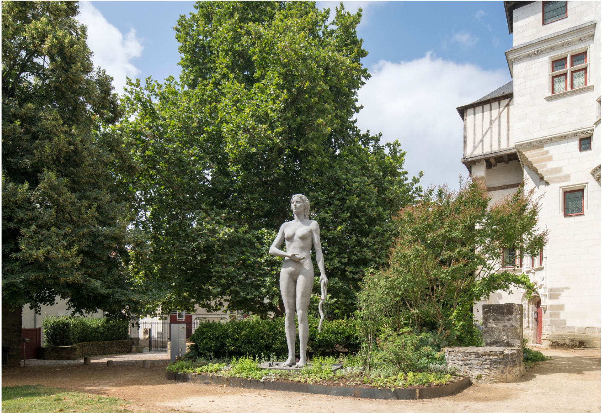
Je serais douce , 2023, volcanic stone and burnt wood, 550 x 200 cm