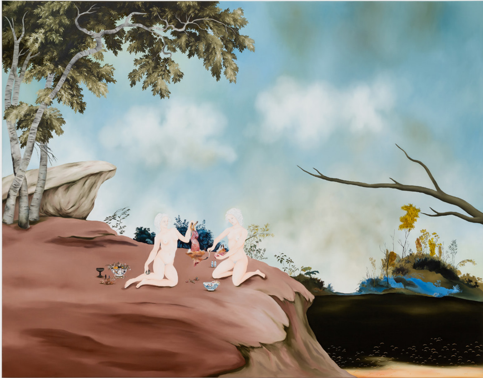
Fantastic Beasts , 2019, oil and pencil on canvas, 180 x 230 cm