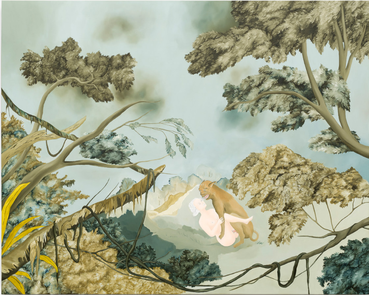
Juicy Lucy , 2016, oil and pencil on canvas, 160 x 200 cm