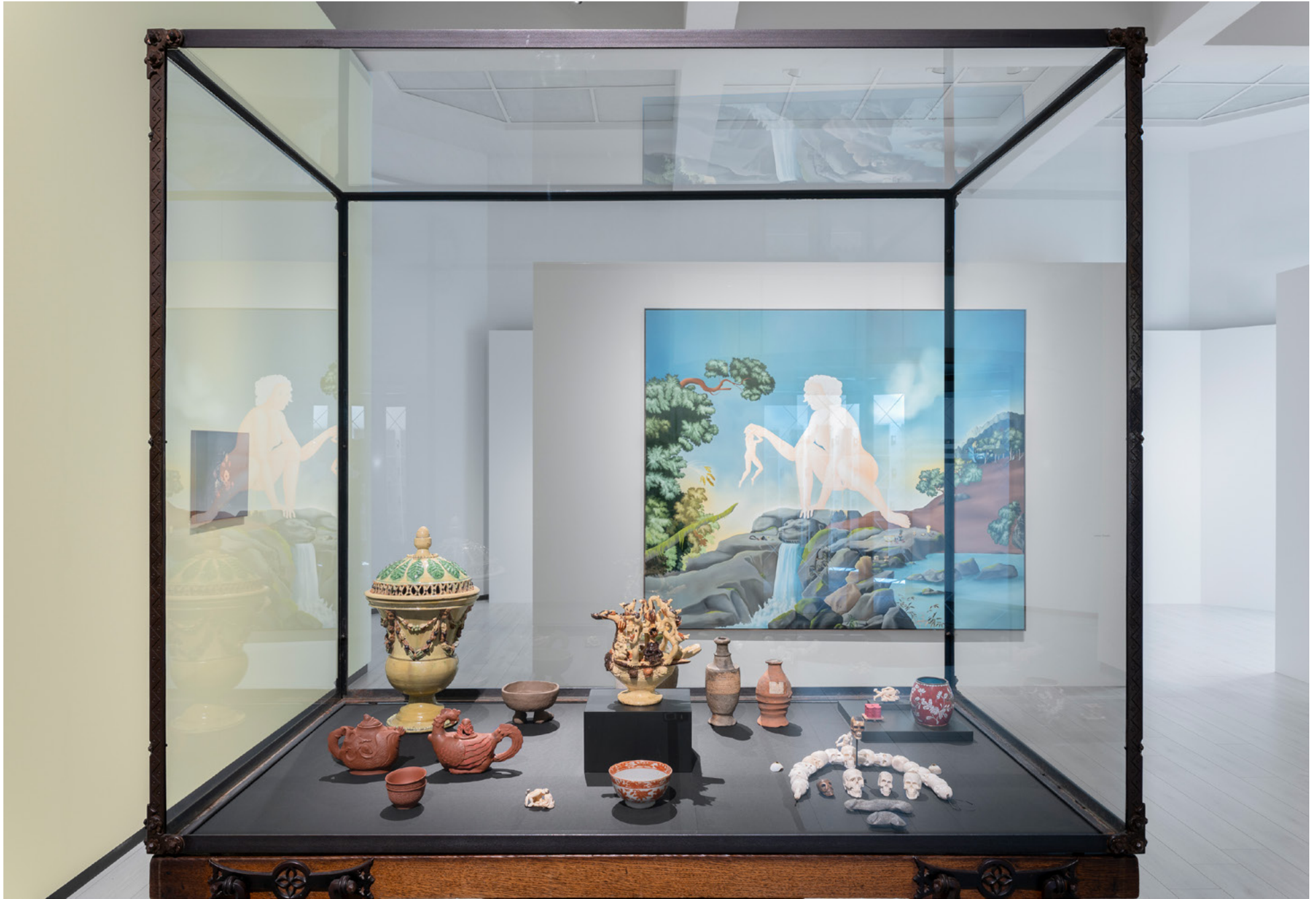
Lemon Drizzle , Groeninge Museum, Bruges, 2021