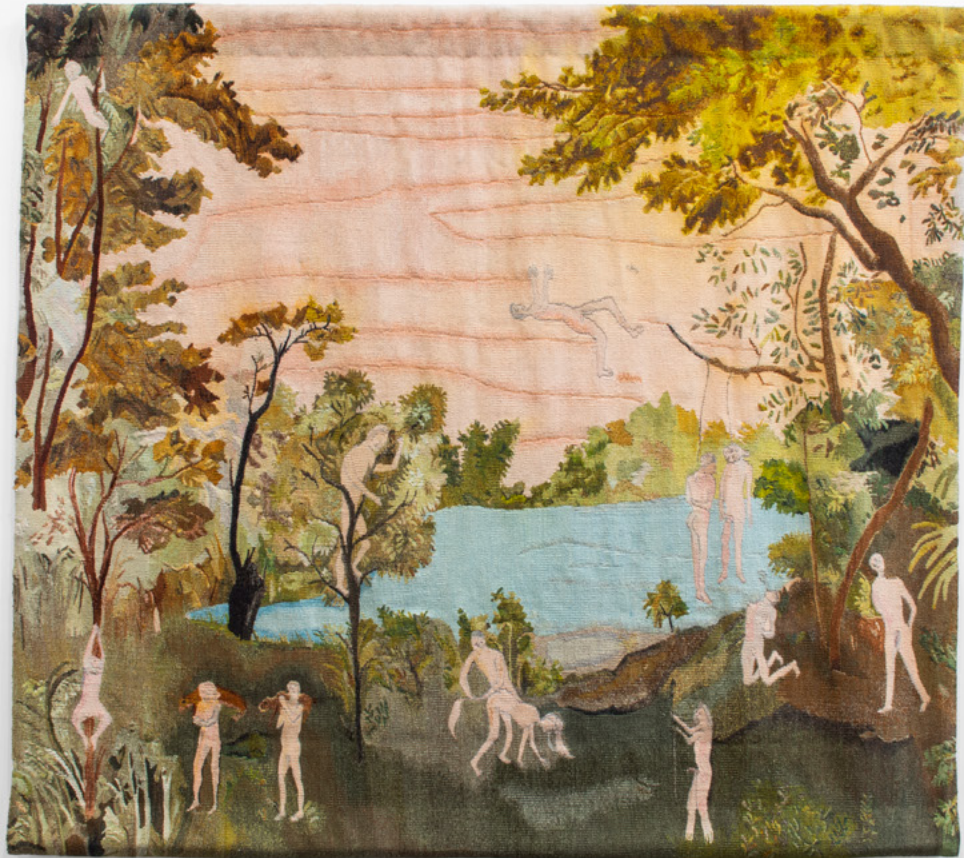
Nothing has ever worked for me , 2022, hand-woven wool, 221 x 247.5 cm