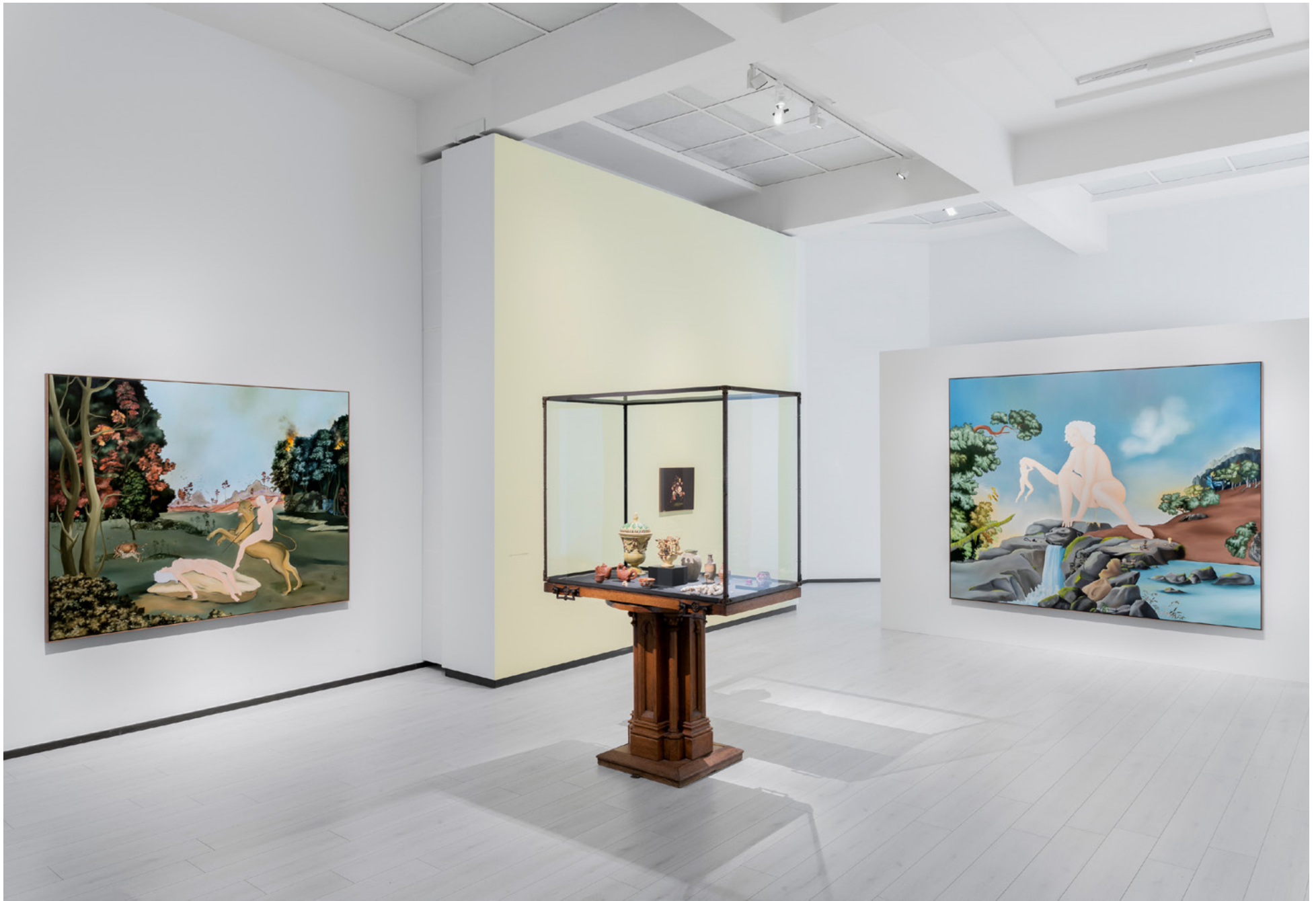
Lemon Drizzle , Groeninge Museum, Bruges, 2021