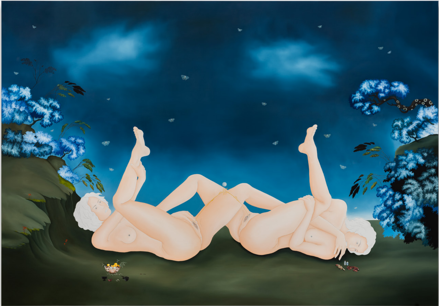
Garden Scene (it is said they are each other) , 2022, oil and pencil on canvas, 210 x 300 cm