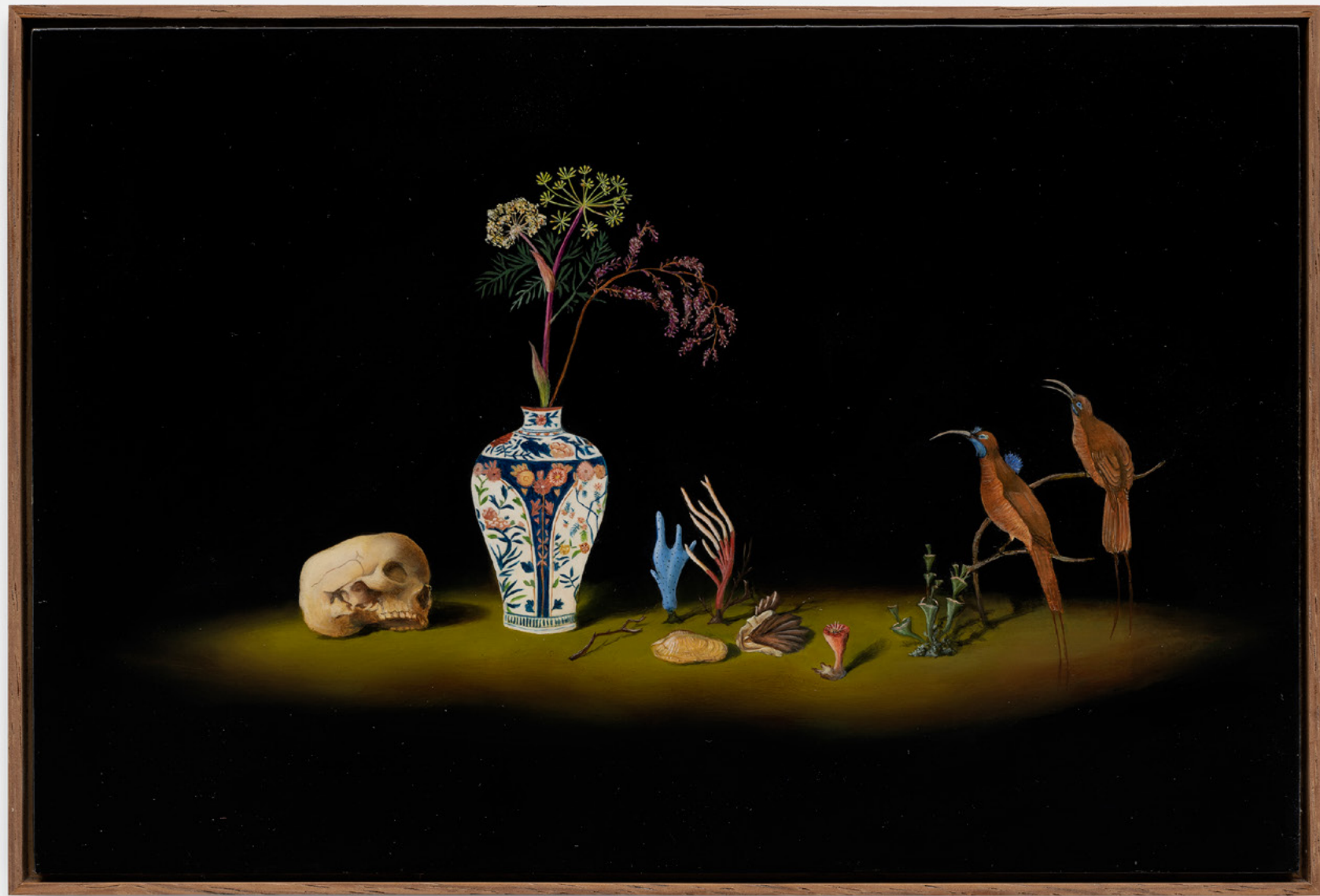
She can't pass a mirror without seducing it , 2020, oil on panel, 21 x 31 cm