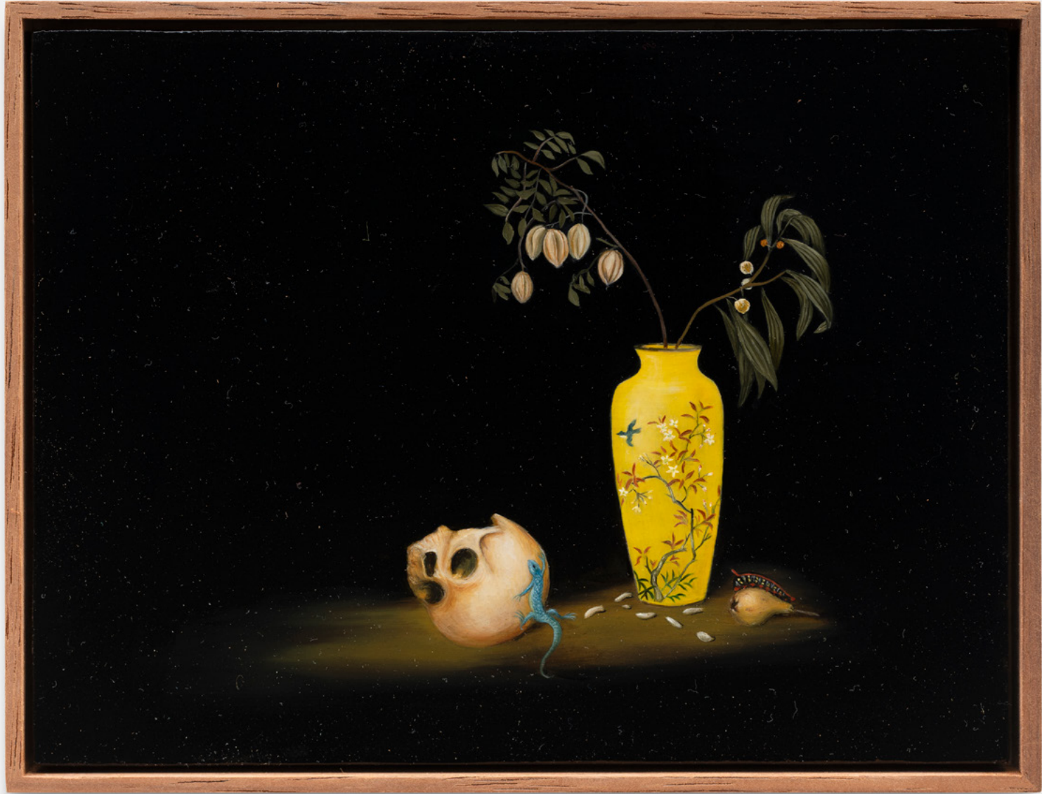
Please forgive me if I have been too blunt , 2020, oil on panel , 16 x 21 cm