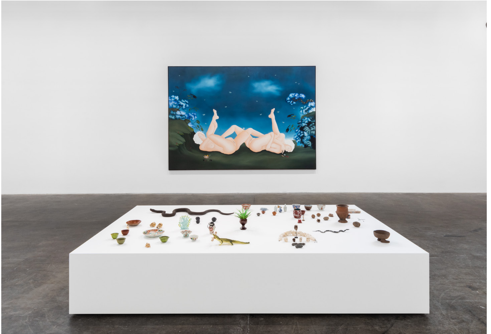
In my dreams, I kill him every night , Mendes Wood DM, São Paulo, 2022