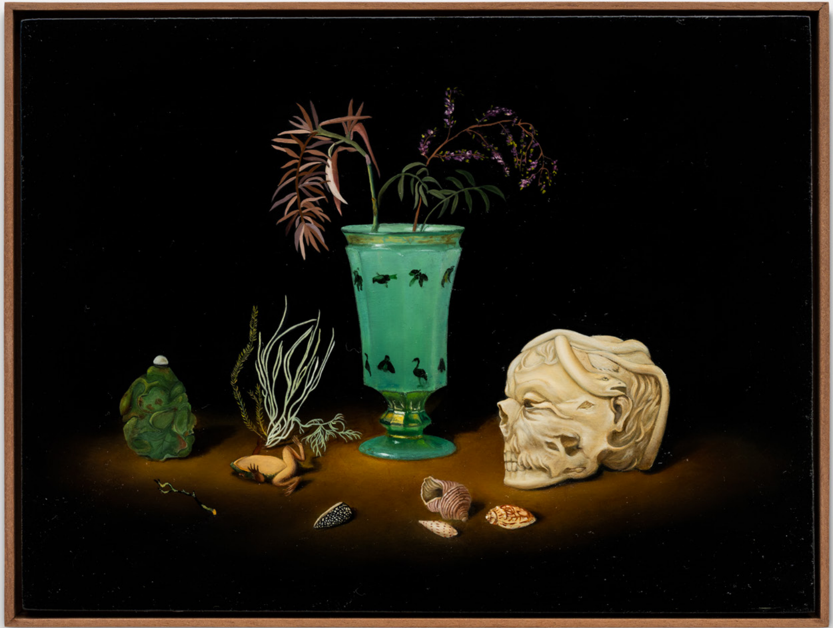
Dead flowers in a vase , 2022, oil on panel, 23.9 x 31.4 cm