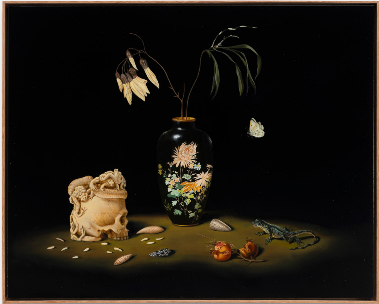
Pharaoh's Dance , 2020, oil on panel, 41 x 51 cm