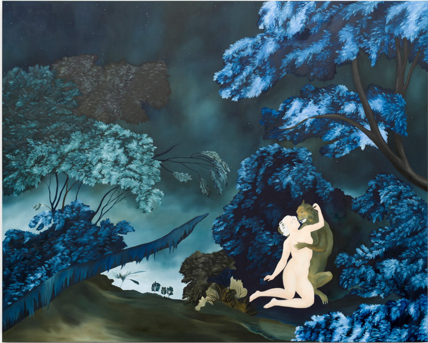
A venison of loveliness , 2016, oil and pencil on canvas, 160 x 200 cm