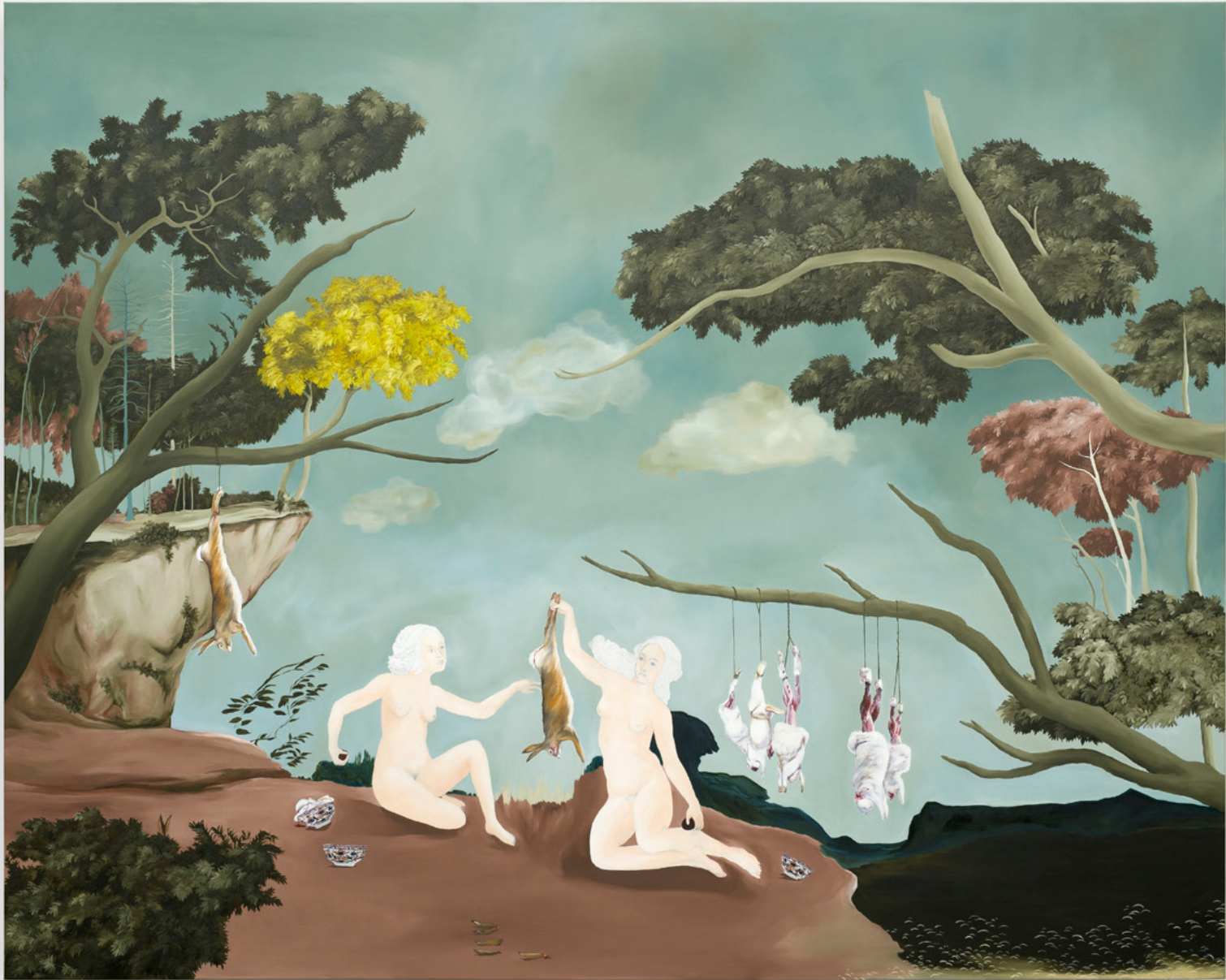
With tenderness and longing , 2016, oil and pencil on canvas, 160 x 200 cm