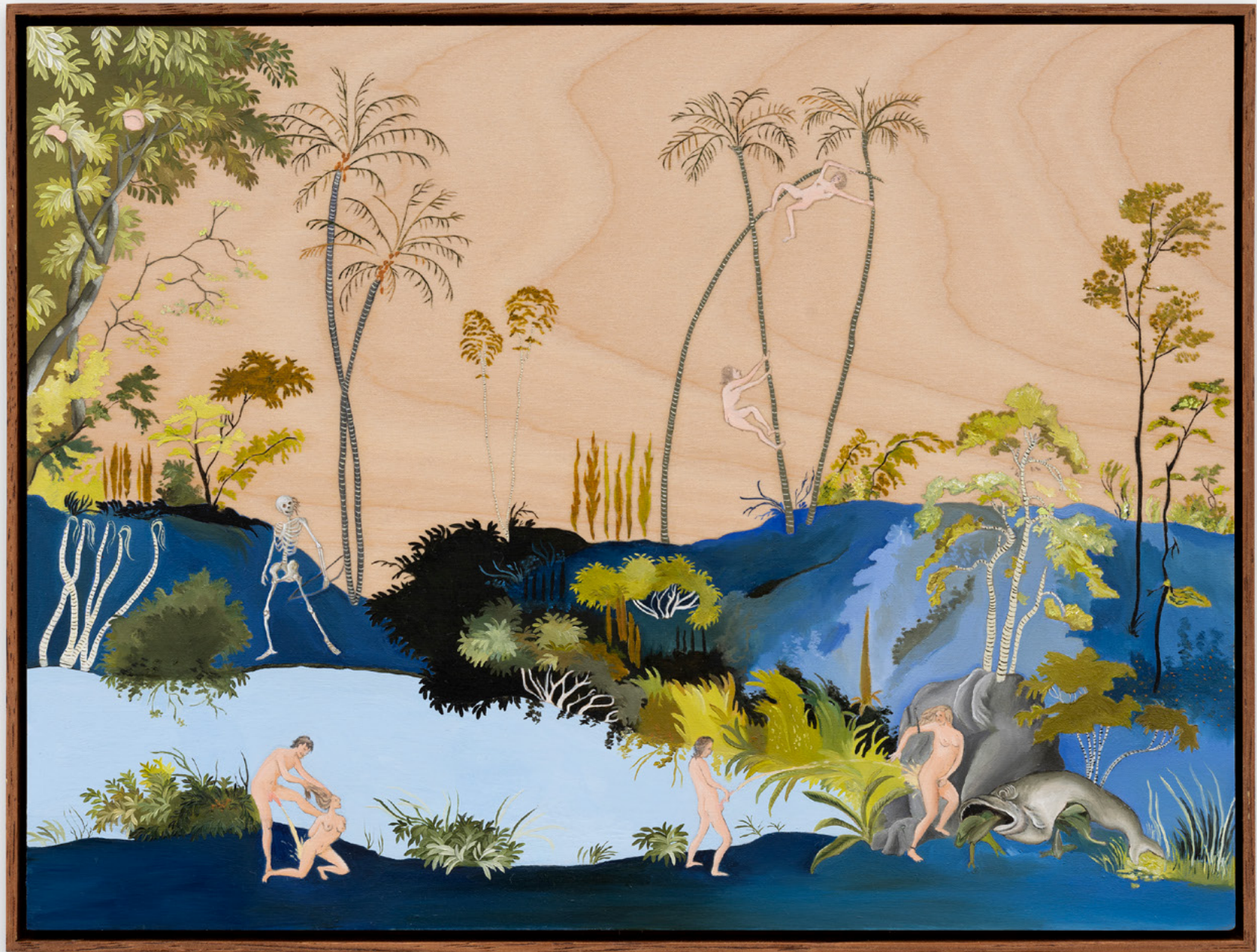
Disfigured Objects , 2021, oil, pastel and pencil on canvas , 24 x 31.6 cm