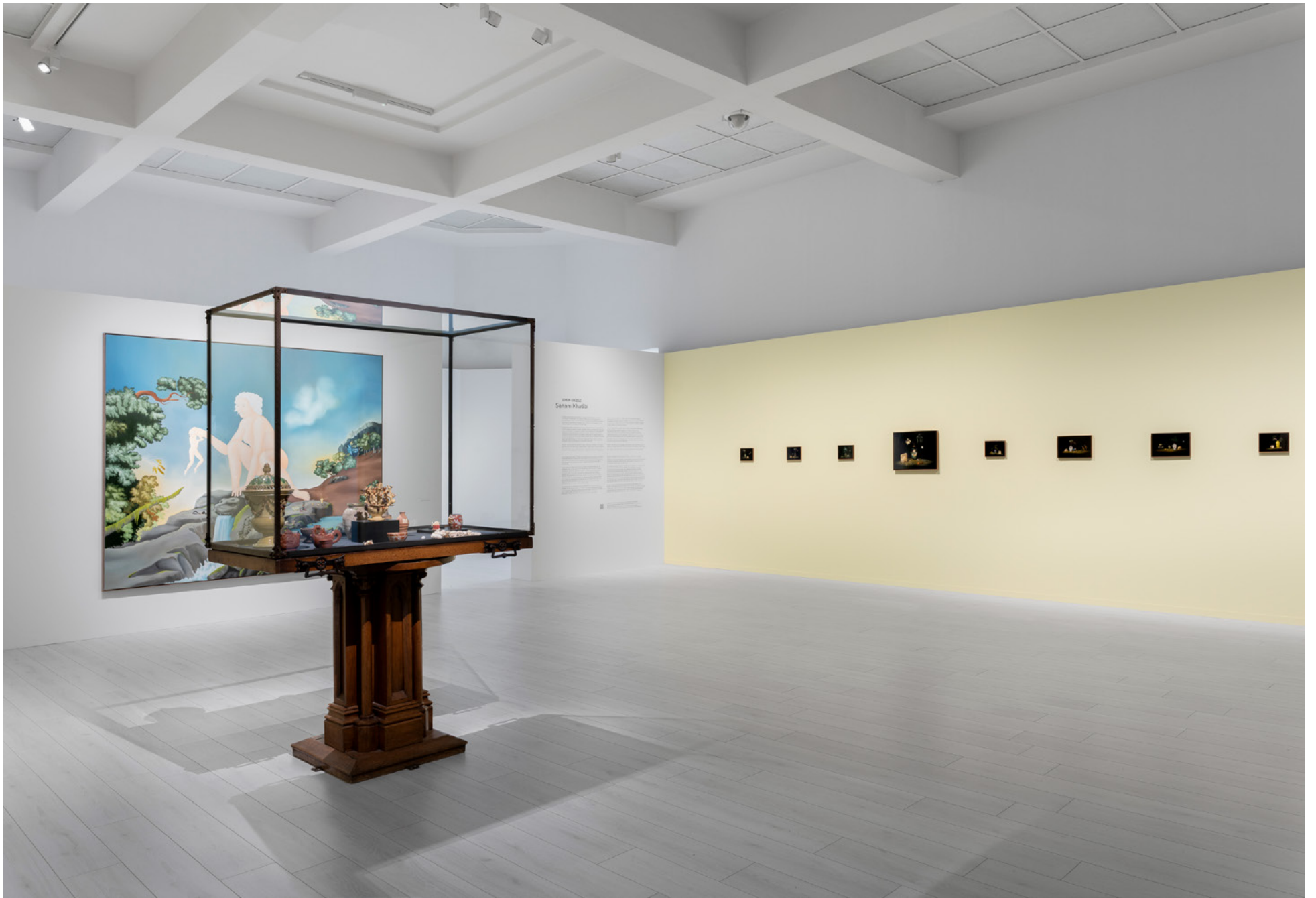
Lemon Drizzle , Groeninge Museum, Bruges, 2021