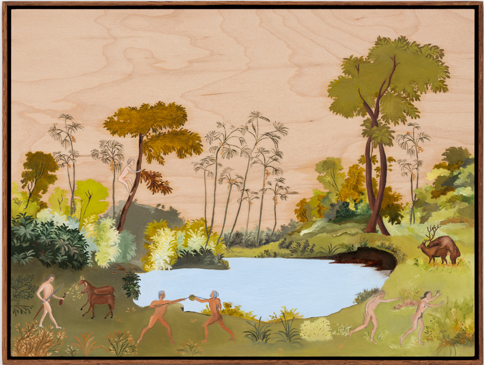
Little Charlatans , 2021, oil, pastel and pencil on panel , 24 x 31.6 cm