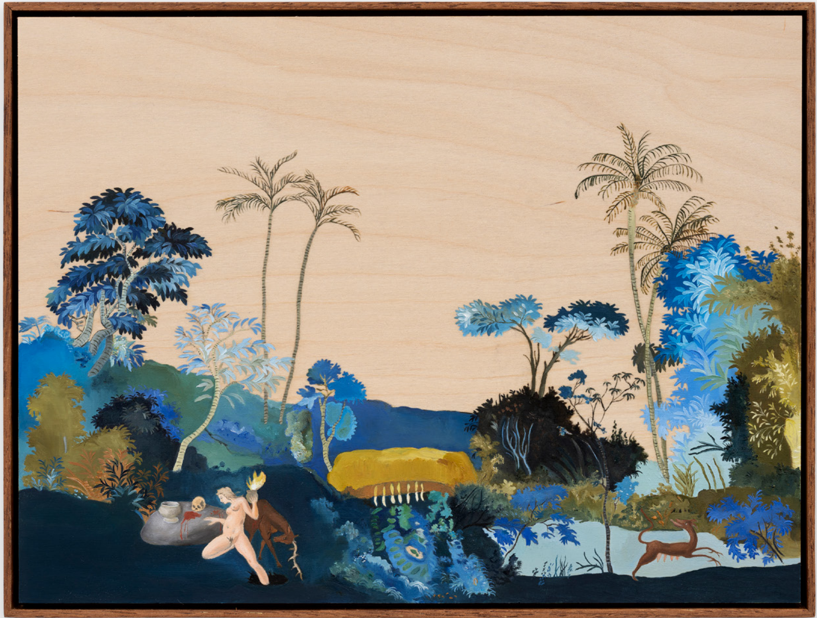
Sonnets to Orpheus , 2021, oil, pastel and pencil on panel, 24 x 31.6 cm