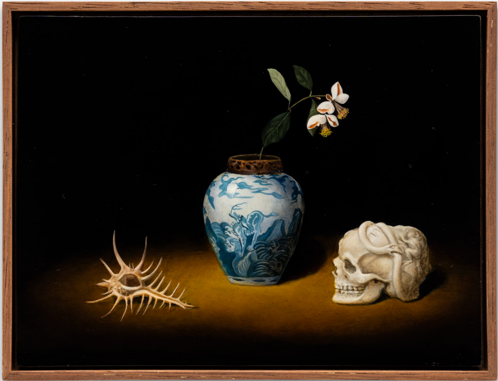
As if forgotten for centuries , 2022, oil on panel, 16 x 21 cm